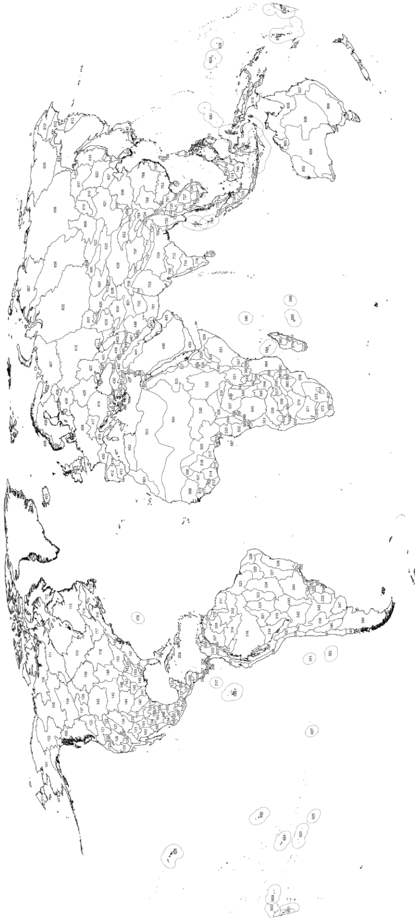
Figure 1. Map of freshwater ecoregions of the world, in which 426 ecoregions are delineated. An interactive version of this map that includes additional information is available at www.feoww.org .