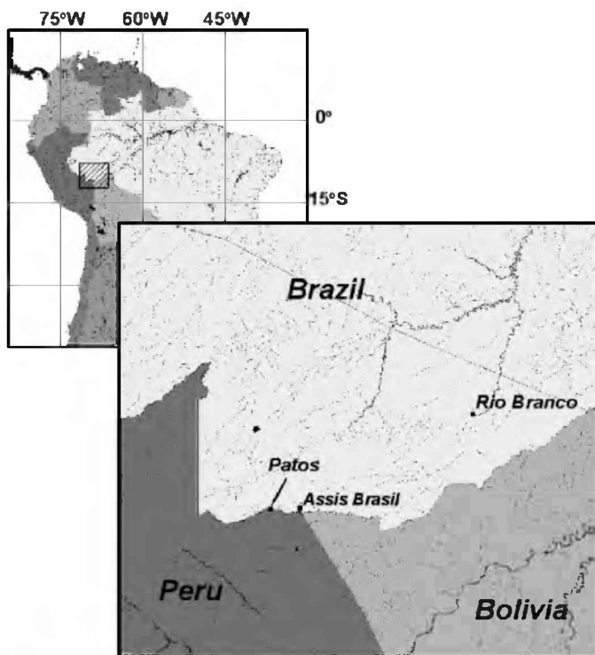
FIG. 1.—Location of the type locality of Didelphis solimoensis .

The temporal interval of deposition for the formation has been reported as spanning from Paleocene to Pleistocene but examination of recent data indicates that its range may be from late early Miocene to late Miocene (Cozzuol, in press; Hoon 1993, 1994a, 1994b, 1995; Hoon et al. 1995). Outcrops in the Acre region, including the ones containing the specimen studied here and other vertebrates, are considered to be of late Miocene age (time equivalent to Huayquerian South American Land Mammal Age) based on the amniote taxa (Cozzuol, in press). Recent radiometric dates from ashes in sediments correlative to the Solimões Formation at 2 Peruvian localities close to the Brazilian border gave dates of 9.01 and 3.12 million years ago (Campbell et al. 2001). The dates are consistent with the age indicated by the fossil vertebrates, but the precise stratigraphic position of the lower ash is not clear (Campbell et al. 2000:77).