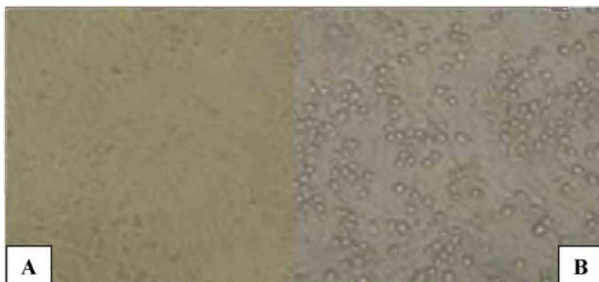
Figure 2. MDCK control cells (A) and cytopathic changes (B) observed at 3 days post infection over MDCK cells inoculated with liquid of skin lesions of a four-year-old female Labrador Retriever. (Obj. 10X and 20X, respectively).