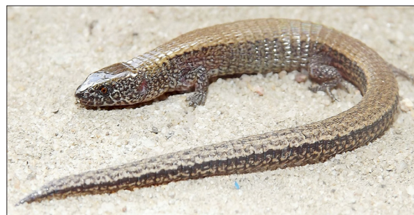
Figure 1. Live adult, male specimen of Colobosauroides cearensis (URCA 11.464) from Mauriti, Ceará.

The current work spreads the distribution of Colobosauroides cearensis in the state of Ceará toward to the municipality of Mauriti (7°22'46.08"S; 38°38'47.87"O) around 356 km to the north in relation to the location of type-species in the Sítio