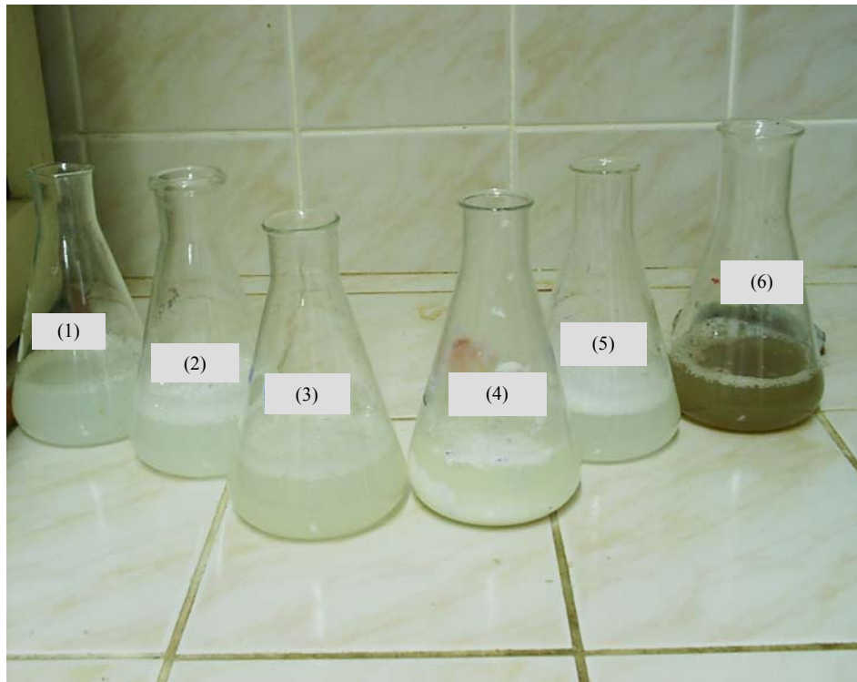
Figure 2. Different fiber behaviors in the dialysis step of digestive simulation. (1) Yoghurt without fiber, (2) Chitosan, (3) Psyllium, (4) Wheat.

Figure 1. Simulation digestive mediums of different fibers before dialysis (37 °C, pH 6.8–7.2 with 0.2 M NaHCO 3 and stirring speed 300 rpm to reproduce the chemical duodenal environment). (1) Inulin, (2) Bamboo, (3) Psyllium, (4) Chitosan, (5) Wheat, (6) Apple.