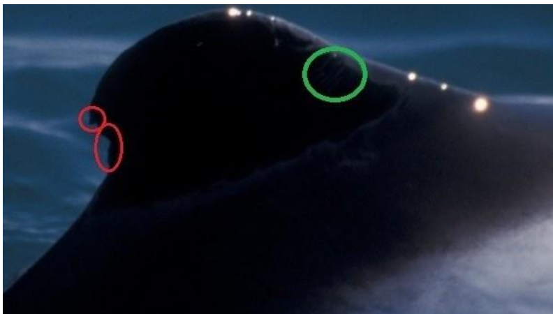
(b) Multiple visible notches and subtle auxiliary mark on the right side

Fig. 1. Individually identified Commersons dolphins in the LAMAMA-CESIMAR- CONICET data base. The red areas show notches in the trail of the dorsal fin. These are considered primary marks. The (often more subtle) auxiliary marks are shown in green. Primary marks are feasible to be recognized from both sides of the animal, while auxiliary marks generally are visible from only one side.