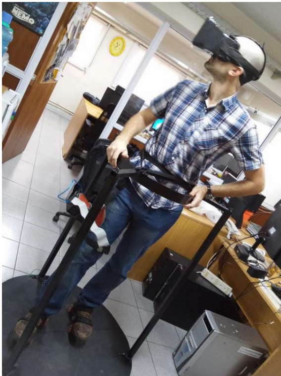
Figure 2: User on the omnidirectional platform. He is wearing a HMD running a Unity3d application on an Android tablet, and the Arduino Uno is attached to his leg.

can walk freely inside the ring while maintaining their position. In order to sense users' movements, an Arduino Uno Microcontroller equipped with a gyroscope is attached to one of their legs. Thus, by measuring the leg angle respecting to the vertical, the system knows whether users are walking or not, and also the corresponding direction. Users are also wearing a Head Mounted Display running a Unity3d application which recreates a complete model of them in a virtual environment. That is, a virtual representation of the user's body and environment in an appropriate scale. By using AnArU framework, a communication between the Arduino on the leg of the user and the HMD application is performed, giving users the sensation that they are really walking inside the virtual environment, increasing the immersion level. A user with all mentioned components is shown in Figure 2.