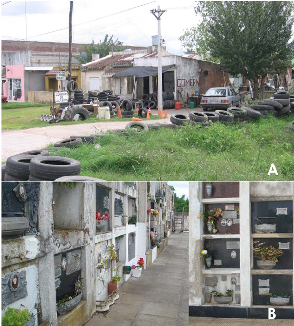
Figure 3. Sampling locations in Buenos Aires province. (A) Tire-repair stations showing tires with accumulated rainwater. (B) Flowerpots at cemeteries. doi:10.1371/journal.pntd.0001963.g003

January 2012 (Figure 2). The sampling stations were located in towns situated along Route N°2 and the other two major arteries that connect Buenos Aires with the south. The sampling stations were cemeteries that are far from the towns and are infrequently visited, and gomerías located in densely populated areas of each town, both at the edge of the roads (Figure 3 and Table 2). Larval specimens were collected and reared until fourth instar or adult stage to facilitate identification using specific keys [13,20]. Voucher specimens,