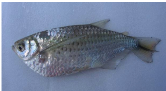
FIGURE 3. Triportheus pantanensis , ILPLA 1969, 107.46 mm SL, Laguna Blanca, Pilcomayo Department, Pilcomayo river basin, Formosa province, Argentina.