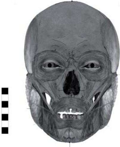
Fig. 2. E1807 Approximate anatomical build-up.

bony attachments, with these attachment points having been approximated in reference to the skull itself. The warp mode was introduced in Adobe Photoshop CS2, and involves being able to apply a mesh over an image, or part of an image, and alter the dimensions either using handle manipulations along the mesh gridlines (similar to the handles used in vector graphics), or in a specific area of the image located within the mesh.