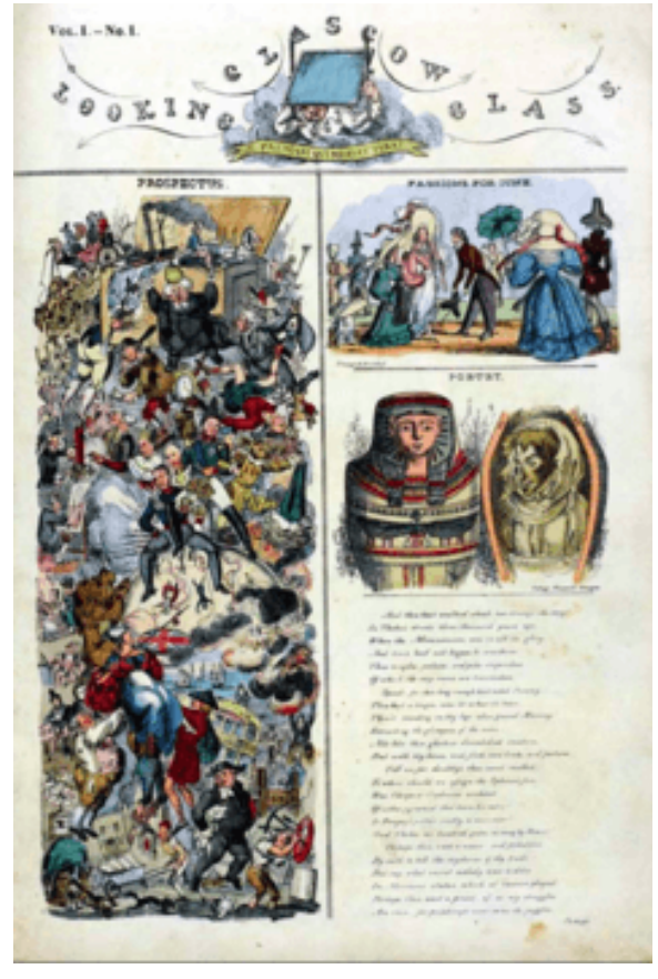
Issue 1 front cover Looking Glass

The Looking Glass contained the world's first comic strip, namely the History of a Coat, whose adventures from owner to owner ran over three episodes. There were many examples of speech bubbles, such as the heated one below between "Billy the Bully and Ranting Dan".