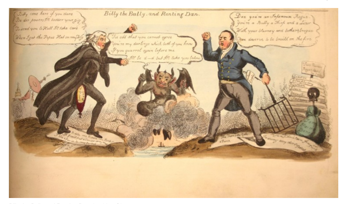
Billy the Bully and Ranting Dan.

Well before the environmental movement as we know it was a cartoon entitled: "The Consumption of Smoke", which gives a futuristic before-and-after imagining of city life without factory smoke. Also eye-catching is the hard-hitting cartoon in the lead image that accompanied an essay on the problem of grave robbing; and the one below that depicts English banks crumbling around a fat John Bull next to thrifty Scotsmen – ironic after the banking crisis in our era.