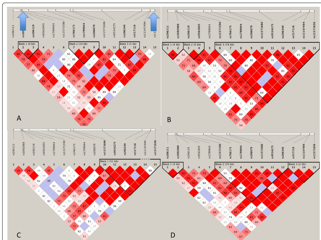
Figure 1 Linkage disequilibrium maps of BRCA region for the 4 ethnic groups. A) Aboriginal B) Chinese C) European D) South Asian. Arrowheads in panel A indicate position of rs11571836 (right arrow) and rs1799943 (left arrow).

disease predisposition. For example, variants in TCF7L2 predispose to both colon cancer and type 2 diabetes while variants in HNF1B predisposes to type 2 diabetes and prostate cancer [28].