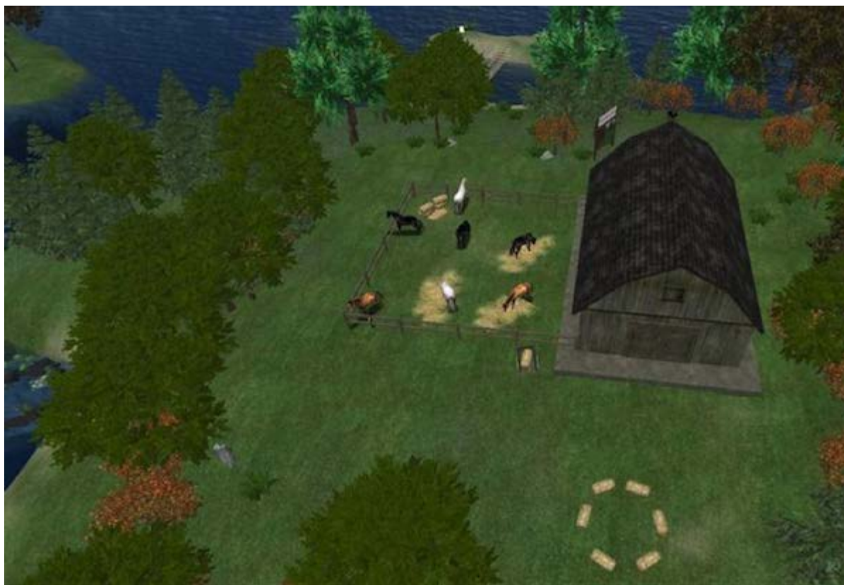
Figure 1: Easter Bush Farm in Second Life