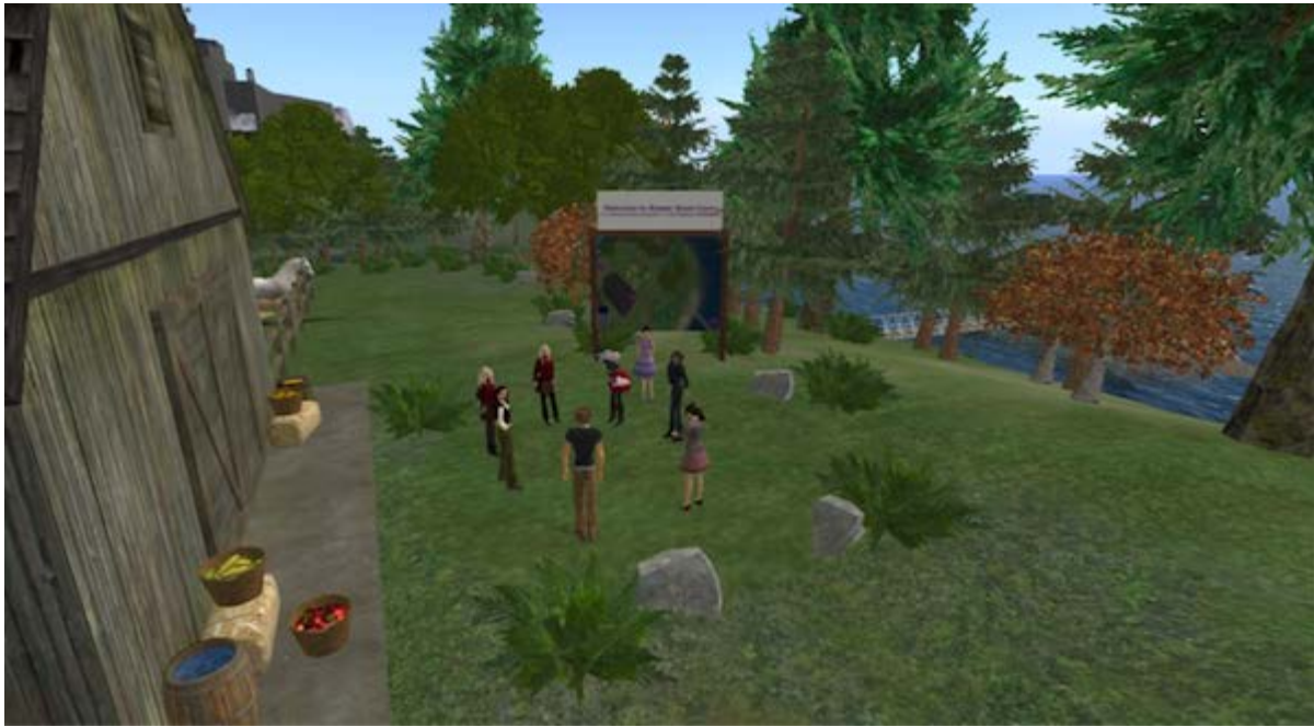
Figure 2: The “meeting place” on Easter Bush Farm in Second Life