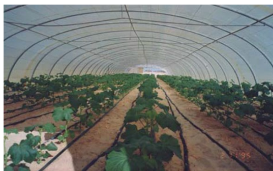
Figure 1: Greenhouse heating in Tunisia (Ben Mohamed and Said, 2008).

Figure 1 shows the interior of a typical geothermally heated greenhouse, with a simple polypropylene piping arrangement providing heat to the crops (tomatoes make up approximately half of the produce grown in the greenhouses, along with several melon varieties). The simplicity and low cost of the heating infrastructure makes this type of direct use application especially favourable for developing countries.