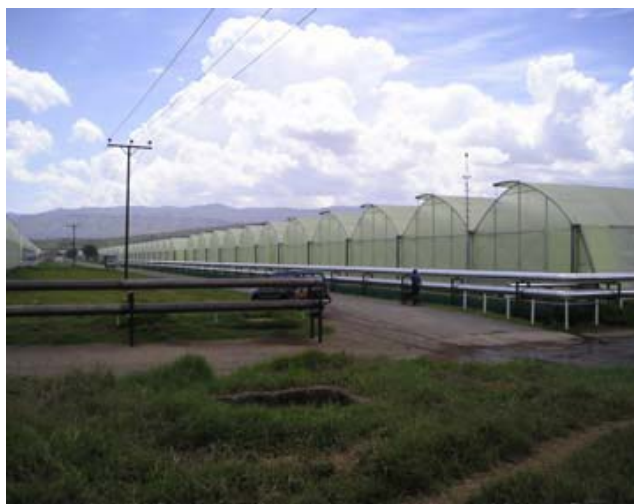
Figure 4: Geothermally heated greenhouses at Oserian (Mwangi, 2006).

Oserian Development Company owns and operates a large flower farm at Lake Naivasha (Knight et al., 2006), close to the established Olkaria geothermal power complex (Figure 4). It is the only company in Kenya to utilise geothermal energy for direct use applications on a commercial scale (Mburu, 2014) and is a prime example of using high enthalpy geothermal resources for a direct use application alongside a successful power generation operation. Since 2003, the firm has extracted geothermal fluids from an exploration well drilled by KenGen in 1983 (Mburu, 2009). The well was isolated from the main Olkaria geothermal power plant production areas, and had a very low power production potential. The geothermal fluids were initially used to heat 4 ha of greenhouses, and following the scheme's initial success, a second nearby exploration well was installed with a 1.2 MW e binary generation plant, which provides electricity alongside additional heated fluid to the farm (Knight et al., 2006). By 2010, Oserian Development Company had invested heavily into its geothermal utilisation efforts (Mariita, 2010) which included the two geothermal power plants installed and operated by the company as well as the direct use component.