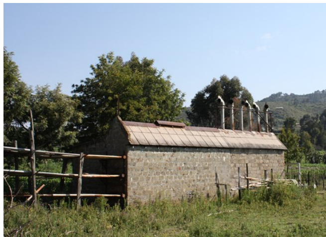
Figure 5: Community scale direct use agricultural drier near Eburru, Kenya.

It is clear that a large number of agricultural and industrial sectors in East Africa could make use of direct geothermal heat: the dairy industry, brewers, large scale food preparation, the tanning and curing industries, covered horticulture and floriculture, and crop drying to name a few. Where geothermal resources are accessible at the surface communities are quick to exploit them (see Figure 5). However, robust data on the scale of the current heat use are not easily accessible.