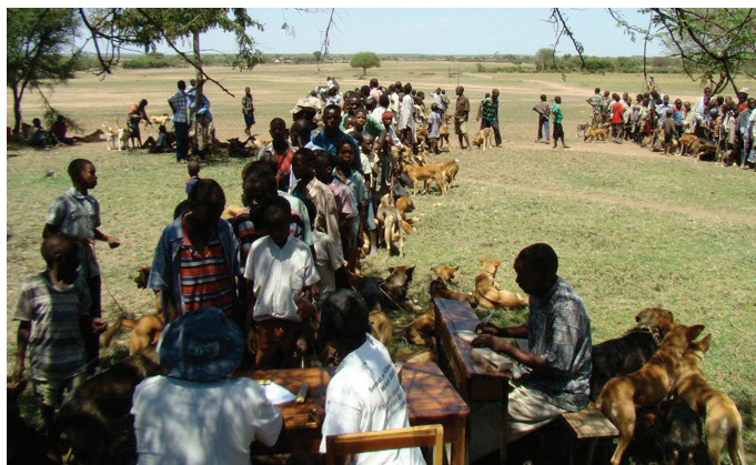
Mass dog vaccination underpins the success of canine rabies control and has been shown to be feasible in most settings in Africa and Asia. Here, owners wait in line to get their dogs vaccinated by an NGO-funded programme in Matongo village, close to the Serengeti National Park in Tanzania