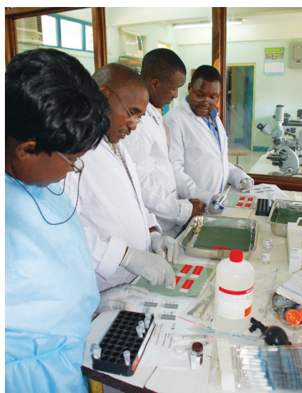
Laboratory personnel in Tanzania performing rabies diagnostic testing on animal samples. Separation of laboratory facilities for diagnostic testing of human and animal samples is costly and hampers the exchange of information and expertise needed for integrated surveillance and control of zoonoses

Although much emphasis has been placed on deficiencies in laboratory capacity, many additional constraints need to be considered in the context of developing integrated rabies surveillance systems. For example, submitting animal samples can be costly, unpleasant and hazardous; families rarely give consent for postmortem sampling of human cases; and efforts to submit diagnostic samples or disease reports often do not result in rapid feedback or beneficial responses for those affected (Halliday and others 2012). New approaches are now available to address some of these challenges. For example, less invasive sampling techniques, such as supraorbital needle biopsy of brain tissue or skin biopsies can provide valuable material for postmortem confirmation of human rabies (Mallewa and others 2007, Dacheux and others 2008). New diagnostic tests have also now been developed that provide simple and effective tools for diagnosis in the field (for example, lateral flow assays; Markotter and others 2009) or within local, non-specialised laboratories (for example; immunohistochemical assays, Lembo and others 2006, Dürr and others 2008b). These techniques