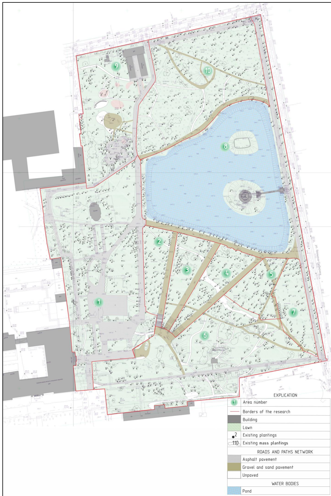
Figure 3. The plan made by digitizing a field survey material with an overlay of the topographic plan.