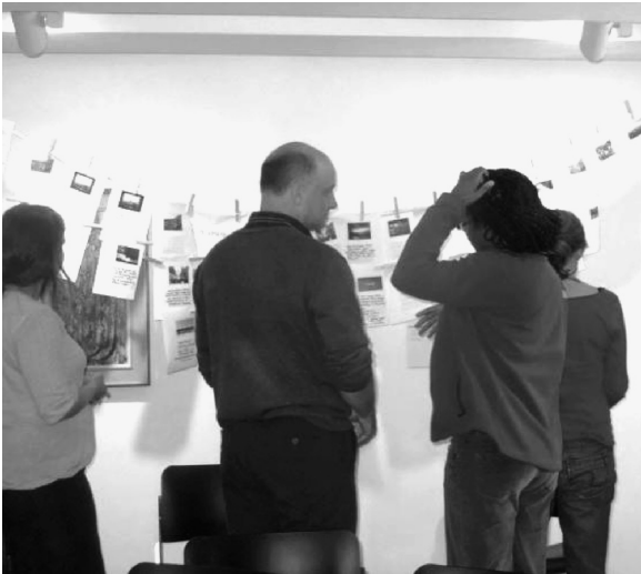
Fig. 1. Workshop participants discuss the 'washing line'.

Marine Energy Parks and work is now underway to prepare sites for 1.6 GW of commercial development. In addition Marine Spatial Planning (MSP) processes are being developed in parallel with the technologies that they will ultimately regulate. Orkney, together with many maritime communities around the world, is now looking to the future in an attempt to understand the social, economic and environmental change that will accompany this new industry.