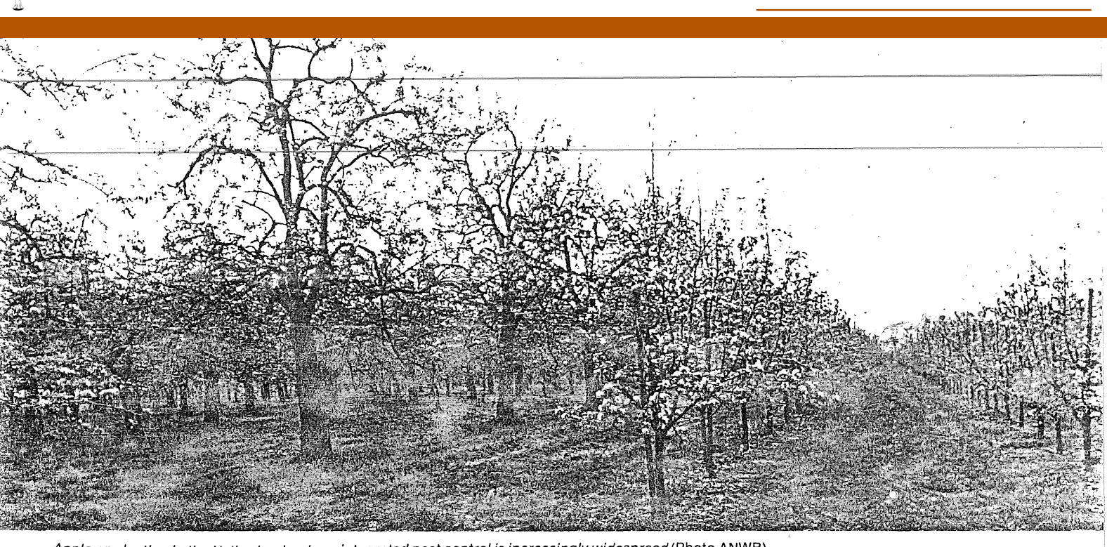
Apple production in the Netherlands where integrated pest control is increasingly widespread