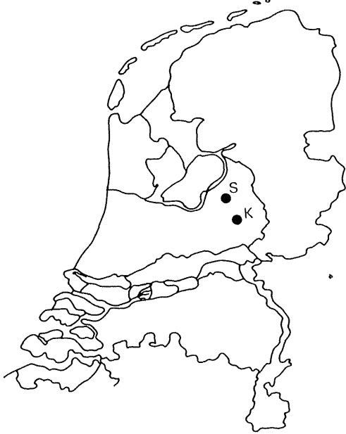
Fig. 1. Location of the two ACIFORN Douglas-fir stands in the Netherlands: K = Kootwijk and S = Speuld.

The two ACIFORN stands were planted on clearcut areas with a coastal provenance of Douglas-fir ( Pseudotsuga menziesii (Mirb.) Franco), and are located 10 km apart in the 'Veluwe' area in the Netherlands (Figure 1). The stands are