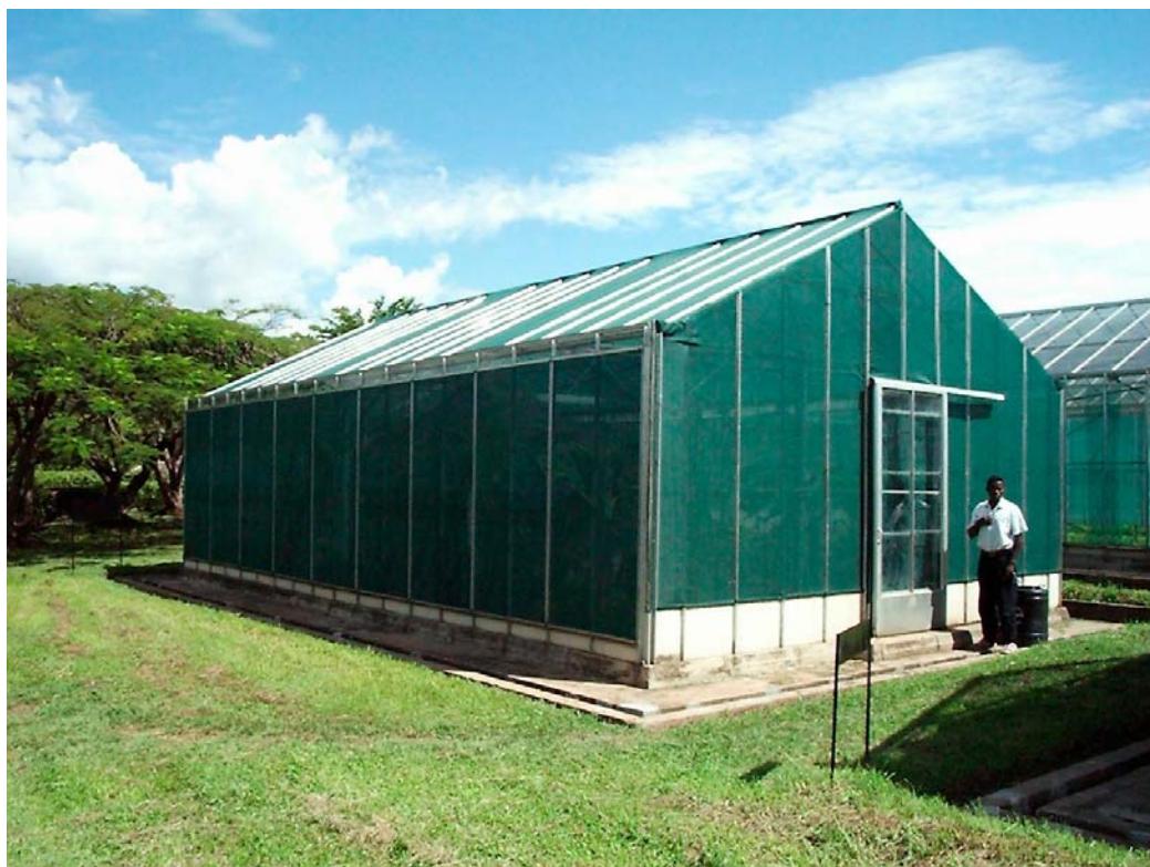
Figure 1. Greenhouse semi-field environment for studies with An. gambiae .

Semi-field environments for behavioural and ecological studies with wild and laboratory-reared An. gambiae have been developed in West Kenya at the Mbita Point Research and Training Centre (ICIPE) since February 2000. None of these have so far been used for studies with transgenic strains, but valuable insights into the benefits and constraints of such systems have been obtained. Seven existing greenhouses (7.1 x 11.4 m) have been modified for studies involving mosquitoes (Figure 1) and mosquito rearing (Figure 2). One of these has been designed to simulate a natural An. gambiae ecosystem, dubbed the ‘Malariasphere’ (Figure 3).