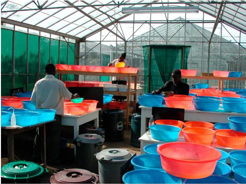
Figure 2. Semi-field based An. gambiae insectary