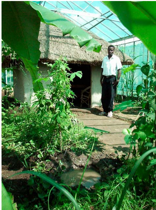
Figure 3. Semi-field setup which simulates the An. gambiae ecosystem (note breeding site in the foreground)