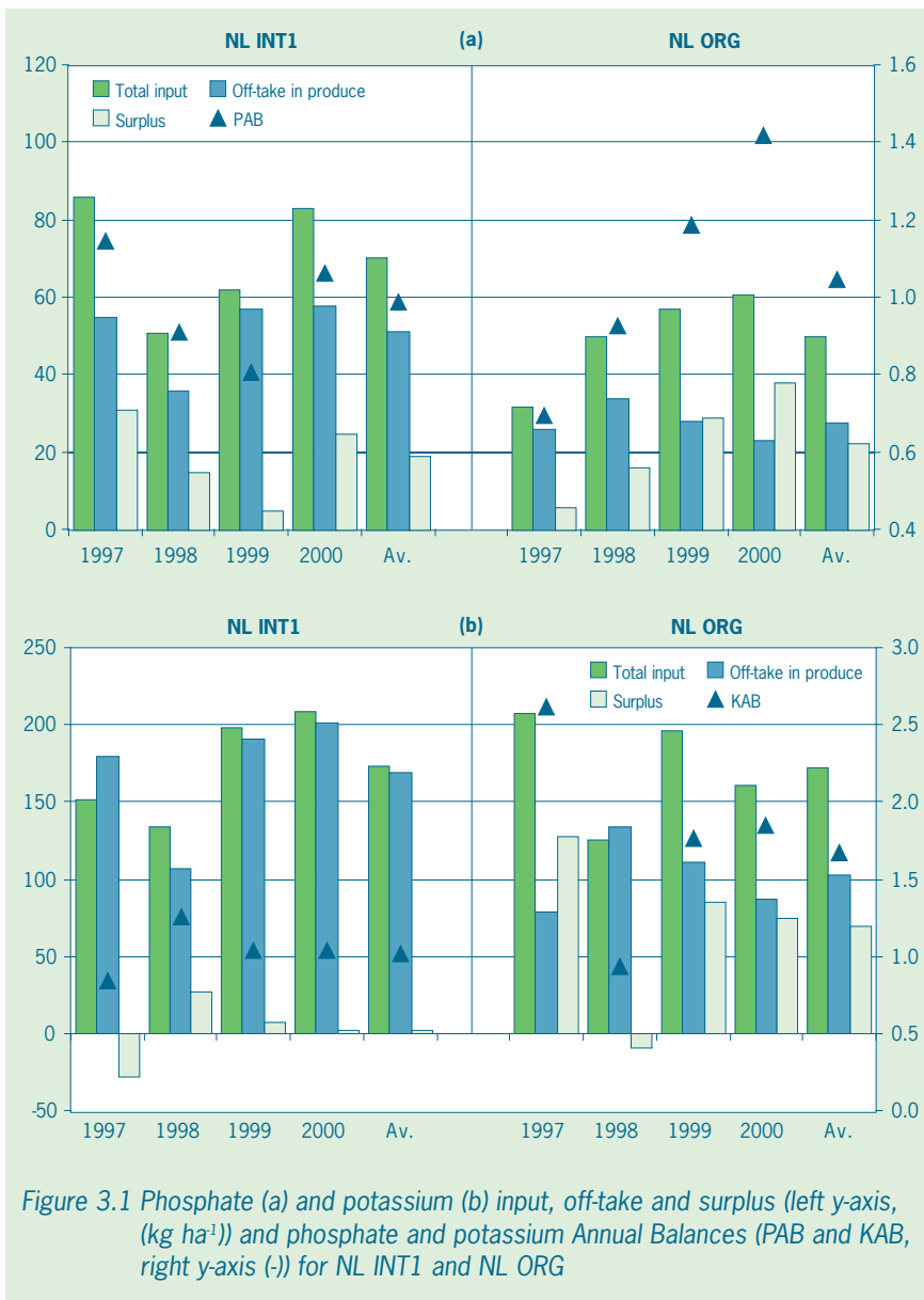
Figure 3.1 Phosphate (a) and potassium (b) input, off-take and surplus (left y-axis, \text{kg ha}^{-1} ) and phosphate and potassium Annual Balances (PAB and KAB, right y-axis (-)) for NL INT1 and NL ORG

after the cultivation of iceberg lettuce. In NL ORG, iceberg lettuce and potato caused a high NAR. Iceberg lettuce had a high NAR because of the low efficiency and large amounts of crop residues. Potato had a high NAR caused by an early harvest because of late blight.