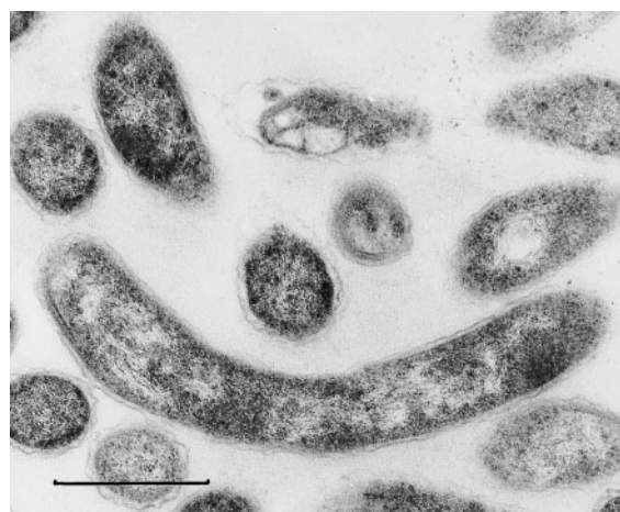
Fig. 1. Transmission electron micrograph of cells of Sulfurospirillum halorespirans sp. nov. PCE-M2 T . Bar, 0.5 µm.

Strain PCE-M2 T was routinely cultivated with PCE as electron acceptor and lactate as electron donor. It was able to couple the oxidation of lactate, molecular hydrogen, formate and pyruvate to growth in the presence of PCE as terminal electron acceptor. Organic electron donors, except for formate, were oxidized incompletely to acetate. Formate and molecular hydrogen sustained growth only when acetate was present as carbon source. Strain PCE-M2 T was able to couple the reduction of a number of electron acceptors to growth (Table 1). Oxygenated sulfur compounds (sulfate, sulfite and thiosulfate) could not replace PCE as electron acceptor, nor could 3-chloro-4-hydroxyphenylacetate or 1,2-dichloroethane.