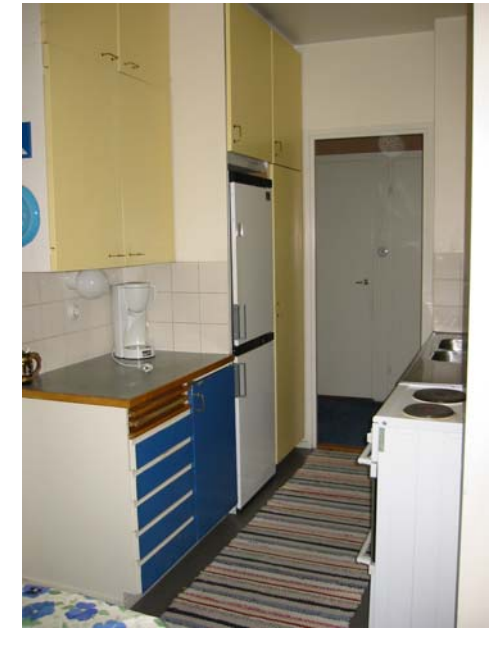
Figure 7. A block of flats in Puotila is built in 1961 and is in need of renovations. Kitchen renovations would improve the functionality of the apartments. Many of the inhabitants are elderly people and wish to stay in their homes.