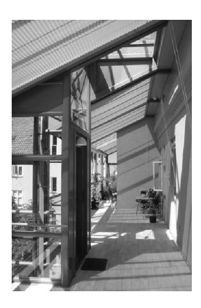
Figure 6. Another urban renewal demonstrations project where broad recreational balconies and an elevator were built outside the facade of an existing building. In this case one elevator gave access to more staircases. (http://www.paalsson.dk/)

The standard (net) size of elevators for new multifamily buildings is 1,1m x 1,4m. The minimum door width is 80 cm. For office buildings and buildings where the general public has access the net size of elevators is 2,0m x 1,4m. (http://www.dcft.dk). In old buildings it is not always possible to fit such elevators. In January 2002 one of the urban renewal companies (SBS Byfornyelse)