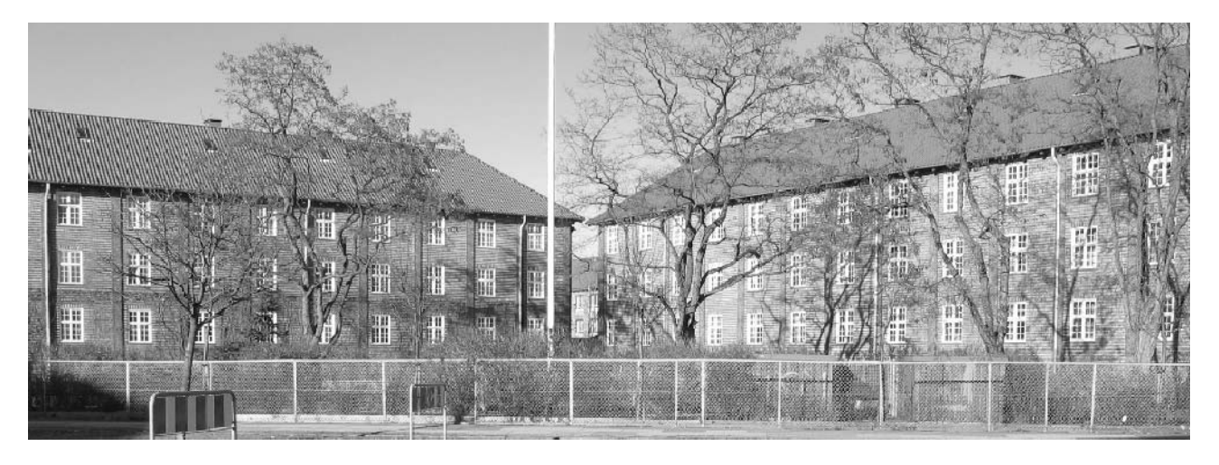
Figure 3. Engholmen Nord housing estate in Copenhagen

In one of the 13 housing estates - Engholmen Nord - a pilot project was made about 10 years after the modernisation process: A social care taker was employed by the non-profit housing association. An evaluation of this special service is what this case is about.