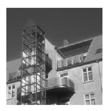
Figure 5. Urban renewal demonstrations project where small balconies and an elevator have been installed. The elevator was installed because new flats were made in the attic. Thereby also the other flats got access by an elevator.