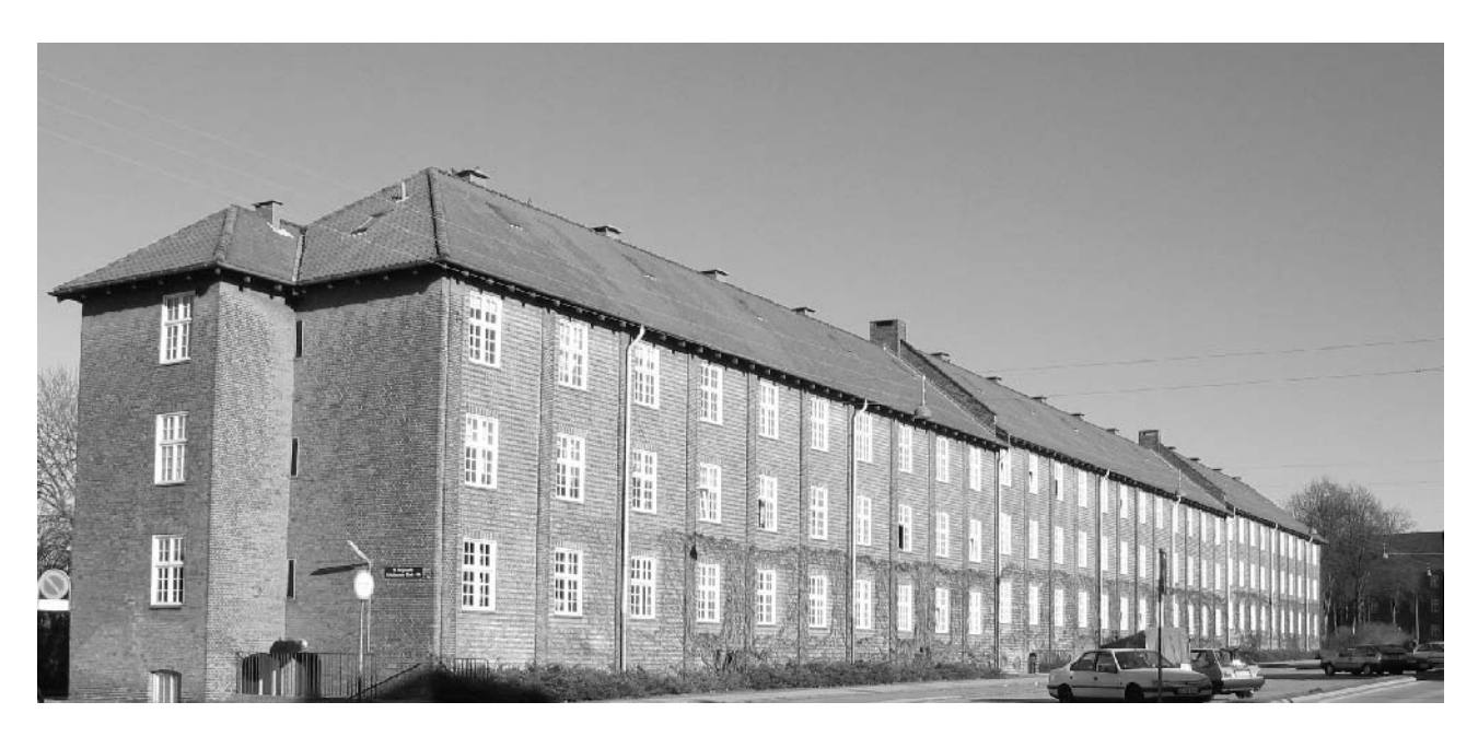
Figure 4. A social caretaker was employed for Engholmen Nord.

After the modernisation process there were 87 2-room flats and 40 1-room flats, total 127 flats. So most of the previous 1-room flats had been merged to 2-rooms flats.