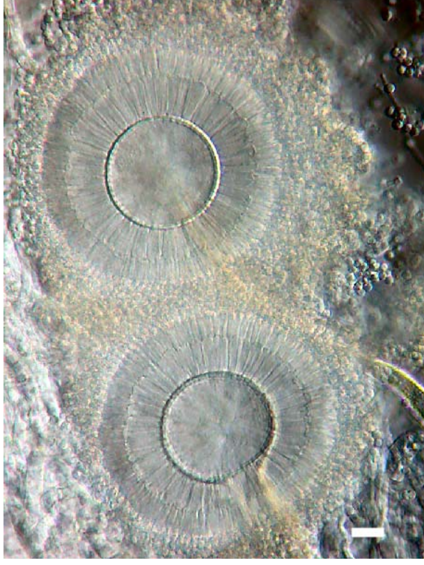
Fig. 1. Aspergillus westerdijkiae. MycoBank accession number MB500000 (Frisvad et al. 2004).

Participants of the Eleventh International Congress on Yeasts (15–20 August 2004, Rio de Janeiro, Brazil), have welcomed this initiative and decided to support it. Yeasts researchers will be able to include their new species descriptions online. This will include all morphological, physiological and molecular data. Pictures, textual descriptions, bibliographical references and relevant internet hyperlinks (GenBank, PubMed) will also be made available. The research