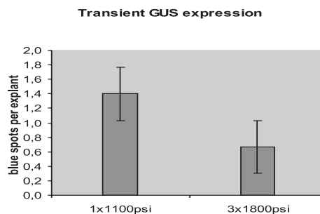
Figure 1. Transient GUS expression 5 days after bombardment. A single bombardment at 1100psi (1x1100psi) resulted in twice the number of transient expression events compared to the treatment with 3 shots at 1800psi (3x1800psi). Vertical bars show standard error

Transient GUS expression was measured by counting the number of blue spots per explant 5 days after bombardment. The number of transient events observed in the 1x1100 treatment was twice as high as in the 3x1800 (Figure 1).