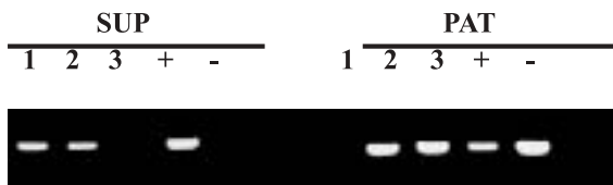
Figure 2. PCR amplification of inserted genes. PAT gene fragment was amplified in the three recovered clones, whereas the SUP gene was only present in two of the clones. Positive control (+) was carried out with the plasmid used for transformation, and wild-type genome of Lilium longiflorum was used as a negative control (-) of PCR reaction

Plants were tested for genome integration of PAT and SUP genes. Attempts to perform Southern analysis of the transgenic lily genomes were made but no conclusive results could be obtained. Alternatively, the presence of these genes was assessed by PCR. All three regenerated plants grown on 2mg L -1 Basta ® were positive for the presence of the PAT gene, in accordance with their observed resistance. Two of them, clones 1 and 2, were positive for SUP (Figure 2). Importantly, clones 1 and 2 were derived from the same bombardment dish. Final evidence for their individual transgenic character requires Southern analysis; however, since this technique is not applicable for lily, this question remains unanswered. All clones showed a normal phenotype during the vegetative phase, although clone number three showed a slightly weaker phenotype, with fewer and thinner roots under in vitro conditions.