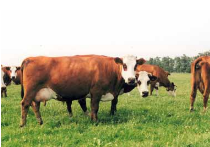
Figure 4. Groningen White Headed cattle, the Netherlands (photo by H.F. Cnossen).

Development of a model Material Transfer Agreement (model MTA) at the international level,