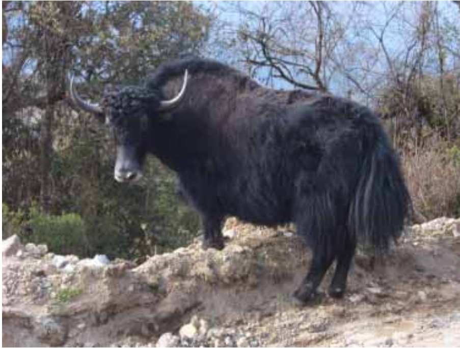
Figure 2. Yak, Bhutan.