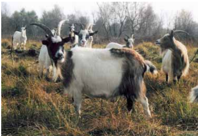
Figure 1. Dutch Landrace goat, the Netherlands.

There is consensus that global AnGR diversity is under pressure. The global livestock sector is increasingly focused on a small number of highly specialized breeds and local breeds are threatened. The existence of threats to farm animal breeds and farm animal genetic diversity is generally accepted,