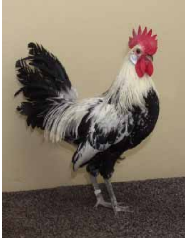
Figure 5. Drenthe fowl, the Netherlands.

Today, almost all farm animal genetic resources are under private control and ownership and not considered to be in the public domain. However, breeds are 'public' in the sense that governments often recognize them as distinct breeds. Commercial breeders generally 'protect' their investments by 'staying ahead' of competing breeders, through physical control of the use of their breeding animals and the use of private law contracts. The use of Intellectual Property Rights (IPR) in animal breeding has to date mainly been focused on trademarks . Developments in patenting in some countries have triggered discussions about the potential impact of patenting on animal breeding methods and animal genes and cells. This has also started a discussion about the need to define the rights of livestock keepers/farmers/breeders over the AnGR they have developed over time and about access rights to AnGR and natural resources. An increasing tension is apparent between existing physical ownership or communal ownership to AnGR and increased use of the patent system in the commercial breeding sector. Regarding developments in the patent system, concerns have been raised that a high number of patent claims and the broad scope of the claims may lead to a significant body of exclusive rights on knowledge and breeding technology with substantial impacts on the use of AnGR.