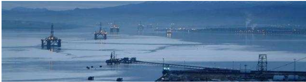
IMARES North, location Den Helder

Institute for Marine Resources and Ecosystem Studies