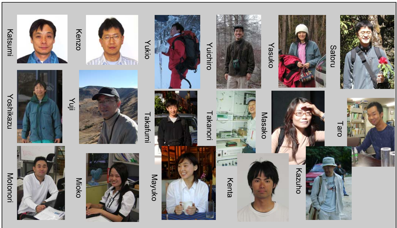
Figure 2: FFPRI team

“FFPRI started the flux observation of heat, water vapor and carbon dioxide at the Kawagoe site in 1995. After the establishment of the fundamental instrumentation, the observation was extended to other six forest sites. This group of sites is named FFPRI FluxNet, since 1999.”