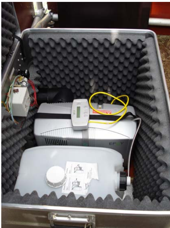
Figure 1: Direct methanol fuel cell installed at Loobos site

carbon dioxide and water." (Direct methanol fuel cell. (2008, September 10). In Wikipedia, The Free Encyclopedia. Retrieved 13:10, September 10, 2008, from: http://en.wikipedia.org/w/index.php?title=Direct_methanol_fuel_cell&oldid=237505556