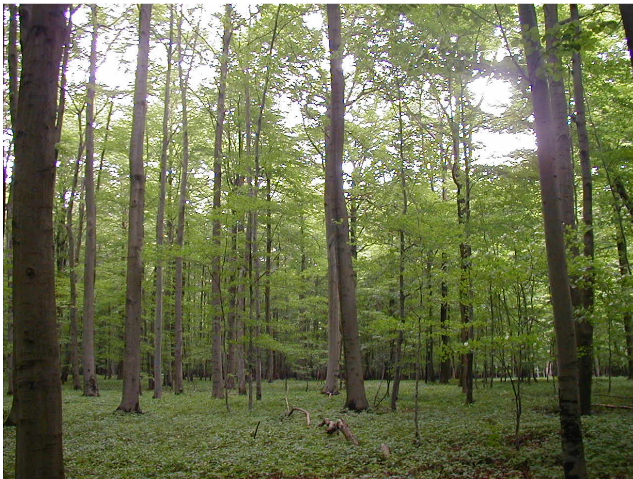
Figure 1: Understory of the Hainich FLUXNET site

Cozzarelli, N. R. (2004) Responsible authorship of papers in PNAS , Proceedings of the National Academy of Sciences of the United States of America , 101(29), 10495-10495