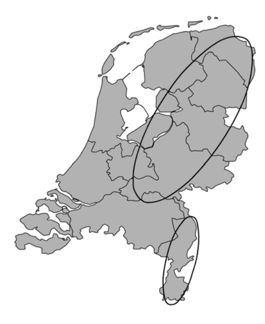
Figure 1. Regions where 90% of the raccoon dogs observed since 1990 in the Netherlands have been recorded. Altogether: 27 sightings ('not verified' included) and 31 found dead (after: Mulder & van der Giessen 2007).

tremely high rate (figure 2) (Goretzki & Sparing 2006, Zoller 2006), causing concerns for a strong negative influence on the indigenous fauna (Stier et al. 2003). During a five-year telemetry project in Vorpommern (Germany) many biological data of density, food, reproduction etc. are collected concerning their settlement as an exotic species in Germany (Stier 2006a, Stier 2006b).