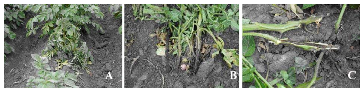
Fig. 1 Symptoms caused by Pectobacterium carotovororum subsp. carotovorum in a potato field crop in the Netherlands. a Wilting of haulms. b Darkening and rotting of above-ground stem tissue (blackleg). c Brown-discolouration of vascular tissue and pith decay

In June first disease symptoms were found, usually recognized as stem or leaf wilting (Fig. 1a) and occasionally a dark colouring of the upper leaves. At the end of the observation period, most diseased plants showed typical blackleg symptoms (Fig. 1b), although frequently blackleg was only visible below ground level, after lifting of the wilted plant. Occasionally only weak blackleg symptoms were observed. The stems of these plants, however, showed