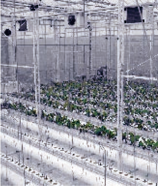
The Synergy Greenhouse in Bleiswijk: a completely closed greenhouse.

system have been compared with that of the traditional greenhouse operated using a pad and fan. The investment and operational costs have been estimated for both systems in the climate of the Gulf Region. Figure 1 shows the gross income per square meter of greenhouse as a function of tomato price. The lines represent values for the current pad and fan system and a closed greenhouse using different ways to raise CO 2 levels. CO 2 enrichment can be done by burning natural gas or by dosing pure CO 2 . Burning natural gas for CO 2 is more economical than applying pure CO 2 . The production of CO 2 by burning natural gas can be combined with production of electricity using cogeneration. From the Figure it can be concluded that, with the assumptions made, the closed greenhouse is more economical than