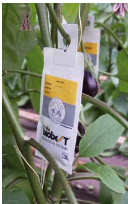
Predatory mite Amblyseius swirskii introduced to fight thrips disturbs biological control of aphids

Wageningen UR Greenhouse Horticulture has researched a number of aspects that