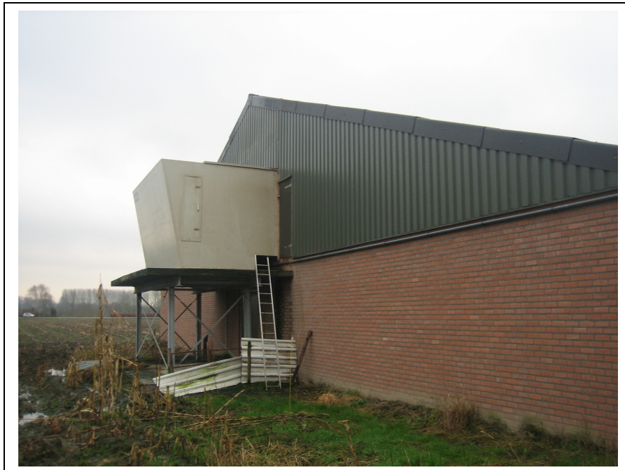
Figure 2. Chemical scrubber installed in a fattening pigs farm in The Netherlands

At present, about 900 farms are equipped with air scrubbers in The Netherlands (Melse et al , 2008). Figure 2 shows a scrubber installed in a piggery.