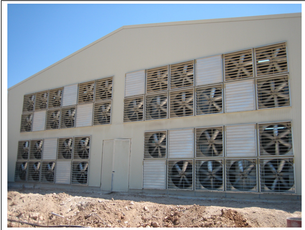
Figure 3. Detail of fans distribution in a Spanish laying hens farm

Cost. Obviously, the cost is always a crucial issue. The operation cost of a scrubber has been estimated for Dutch conditions, being about up to 14 €/year per pig place (Melse and Ogink, 2005). This is a very high cost for Spanish farmers. In addition, this value should be estimated considering country-specific conditions or even local conditions.