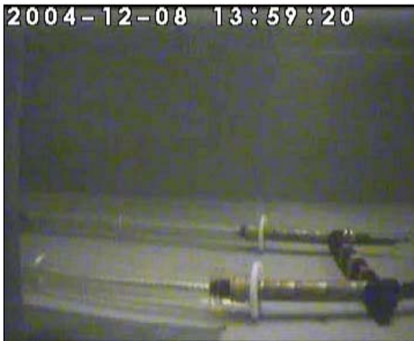
Figure 2 Underwater detail of the conductors fixed at a distance of 325 mm and the isolated extension of 0.6 m.