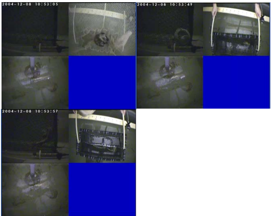
Figure 3 Sequence of a dogfish exposure in the “near field” range. The fish arrived with a body curl (top picture left), after the exposure (top right picture (note the two LED indicators activated at the left hand of the operator). The fish unfolded as a post-reaction (bottom picture), but adopted the original body curl shortly after.