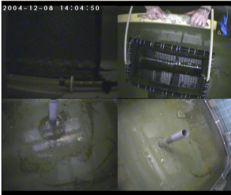
Figure 1 Video image of the of the research tanks with top left the underwater side view on the exposed area with the cage of flexible polyethylene netting positioned between the conductors and top right the view from above with a dogfish being measured. Bottom left is the “near field” recovery tank and bottom right the “above field” recovery tank (the date information is invalid (recorder config bug).