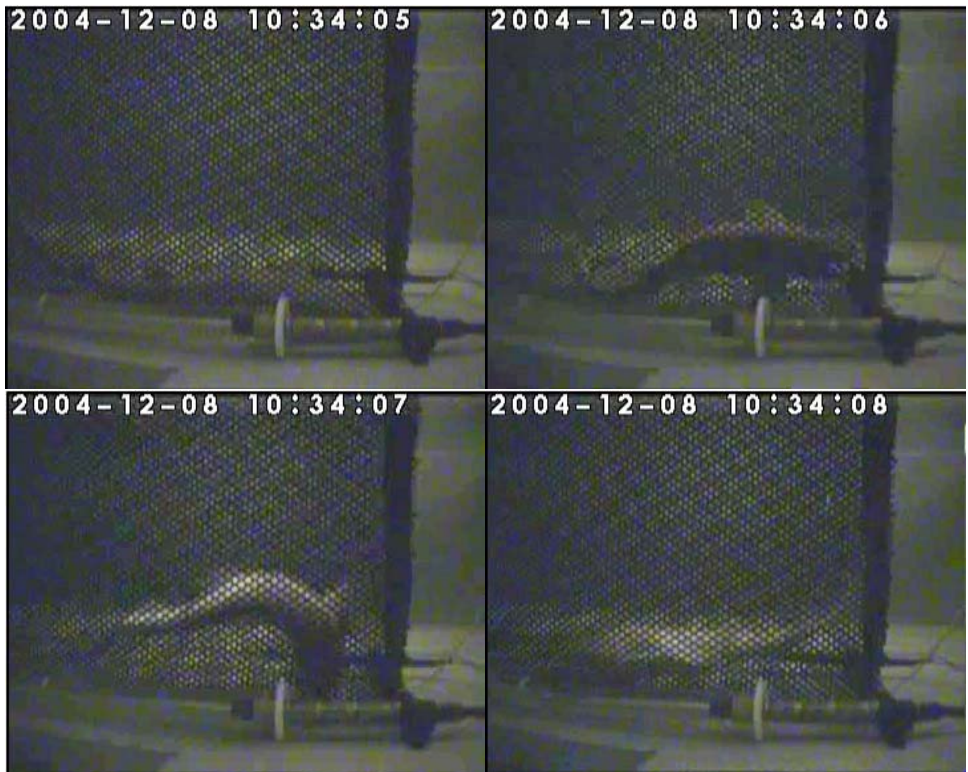
Figure 3 A series of successive video frames, showing the position of the animal at the bottom, top left, and the contraction (top right) and post-reaction (reverse), bottom left and right, of a dogfish exposed in the “near field” range.