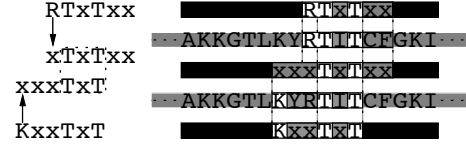
Figure 2: Two neighboring (6, 3) -motifs as sliding windows on a sequence. Moving from RTxTxx to KxxTxT , shifts the window to the left.

It is easy to see that f_{\chi^2} abides the conditions and is biclique-maximal. Indeed, the support for a complete motif pair \{X, Y\} where |V_X| = |V_Y| in any PPI-network G is M(V_X, V_Y)(1 - ed(G))^2 / ed(G) , which is maximal for |V_X \cap V_Y| = 0 .