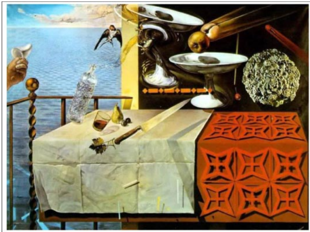
Nature Morte Vivante (Still Life - Fast Moving)

Fig. 2. The challenge of integrating diverse disciplinary perspectives is to retain the precision of diverse elements of the whole to create an overarching picture. The results may seem strange, unrealistic, and surprising, but they allow for novel approaches and new questions to arise. The painting is Nature Morte Vivante (Still Life Moving Fast) by Salvador Dali, 1956, 125x160 cm. The original is in the Salvador Dali Museum, St. Petersburg, Florida, USA.