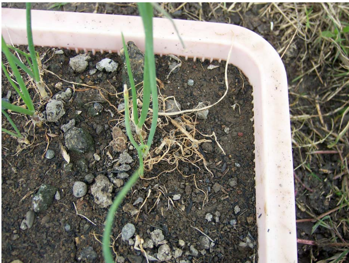
Picture 11. Loss of seedlings in the seed efficiency experiment, probably because of antracnose.

Seed efficiency on beds was much lower than in trays. The structure of the soil on the beds was less optimal than in the trays. Also on beds closing the furrow with soil is giving an improvement of seed efficiency. Sowing deeper (1 cm and 1.5 cm) was giving an improvement in the initial number of seedlings (after two weeks), but after six weeks this difference had disappeared. Drenching with Previcure and closing the furrow with soil was giving the highest seed efficiency. However it is not clear if this effect was caused by the extra watering effect after sowing which was occurring in this treatment. The other treatments were not getting water after sowing. Maybe the seed efficiency could be improved by extra watering. The amount of water which was given is comparable with 2 mm rain.