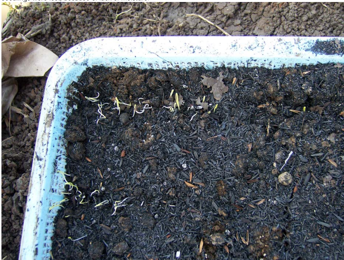
Picture 7. Nursery of the fertilization experiment. Seedlings are lost because of germination in burned rice husks. The covering with nursery mixture was not enough to prevent loss of seedlings.

The nursery was sown on 24 April. The normal procedure for the nursery was followed: the trays were filled with a nursery mixture, consisting of home garden soil, sandy soil and stable manure (volume= 1:1:1). SP 36 and carbofuran were spread over the surface (50 grams of each per m 2 ). Watering was done the day before sowing. The seed was sown in 0,5 cm deep furrows. The furrow was closed with rice husks. A blue plastic sheet was put on the trays for 5 days. Plastic sheet was removed 29 April. Temperature under the sheet was measured: 38 C, while the air temperature was 36 C. At the moment of removing the sheet emergence was estimated at 25 – 30%. It was suggested to remove the sheet earlier. Many seedlings were germinating in the rice husks. These seedlings were lost, because of lack of moisture.