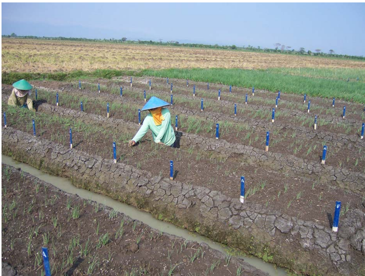
Picture 12. Counting the number of seedlings in nursery on seedbed in the field

The results obtained in the additional seed efficiency experiment are in line with the results obtained in the first seed efficiency experiment: Closing the furrow with soil is improving seed efficiency to a large extent. There is a tendency that sowing at a depth of 1 cm is giving a higher seed efficiency than sowing at 0,5 cm.