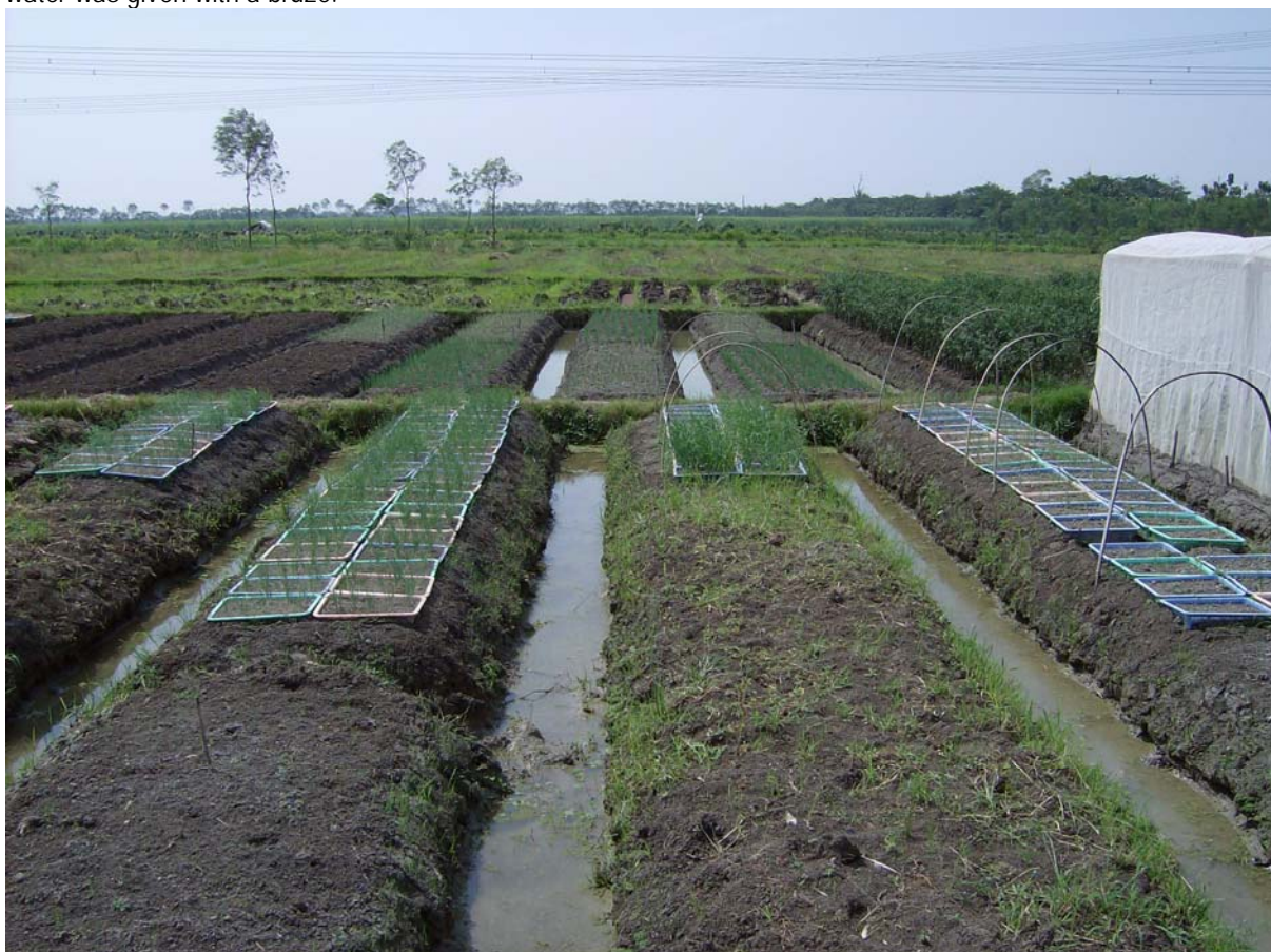
Picture 2. The nurseries of the early sowing experiment and the beds with the transplanted plots, transplanting date 15 April 2009

Two nurseries were sown in trays and on a seedbed: one 11 March, one 25 March. Per tray 1 gram of seed of Tuktuk (= 288 seeds; 259 viable seeds) or 1.4 gram of seed of the Hybrid (= 366 seeds; 253 viable seeds) was sown. The normal procedure for the nursery was followed: the trays were filled with a nursery mixture, consisting of home garden soil, sandy soil and stable manure (volume= 1:1:1). SP 36 and carbofuran were spread over de surface (50 grams of each per m 2 ). Watering was done the day before sowing. The seed was sown in 0,5 cm deep furrows. The furrow was closed with rice husks. A blue plastic sheet was put on the trays for 5 days. After 5 days a shelter was put over the nursery and it was removed one week before transplanting. Two times per day water was given with a bruze.