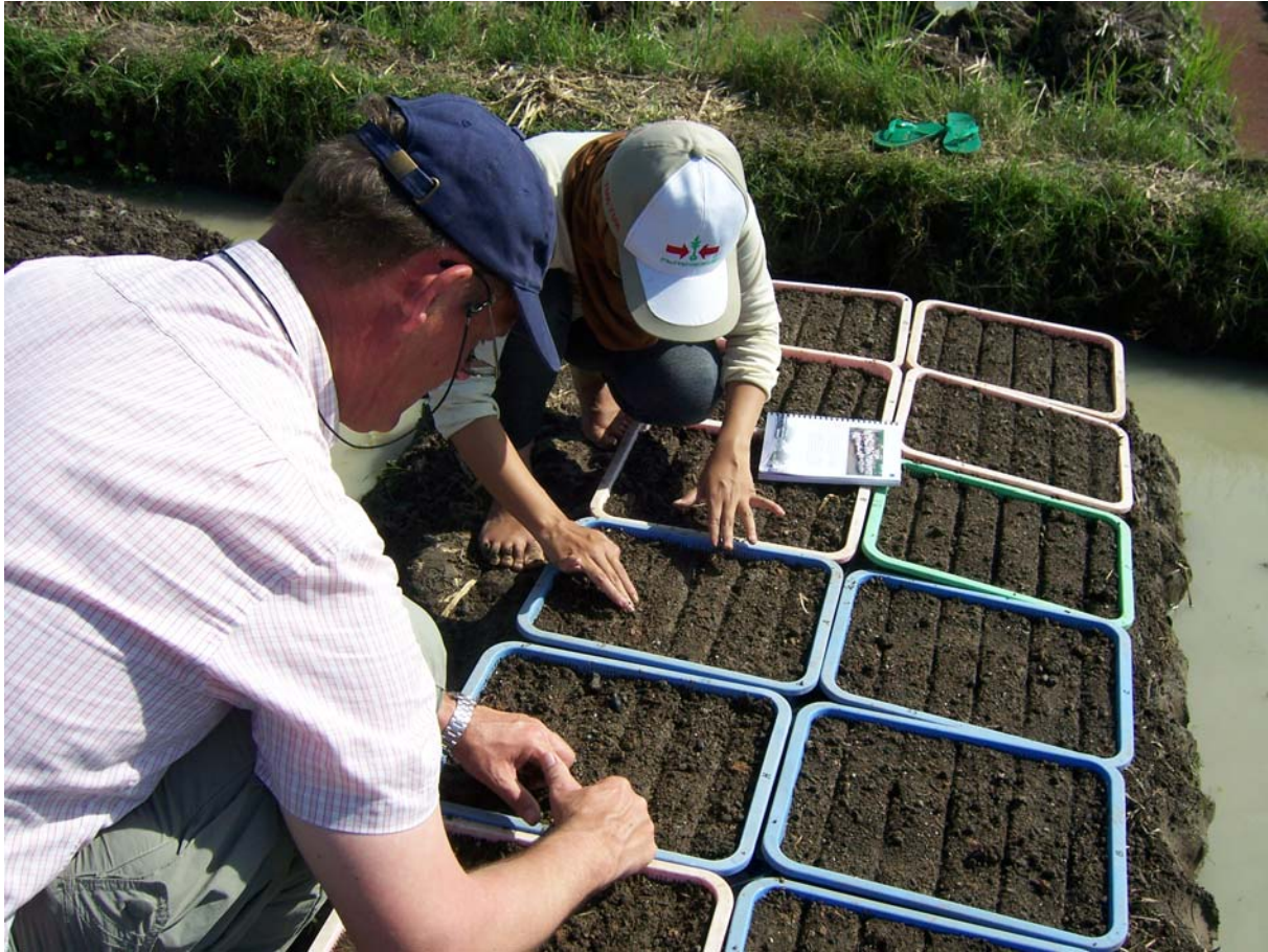
Picture 10. Sowing and covering the seed with soil.

On 29 April an additional experiment was started to test if applying SP36 and carbofuran over the surface of the nursery before sowing, as has been done in seed efficiency experiment 1, could have a negative effect on emergence.