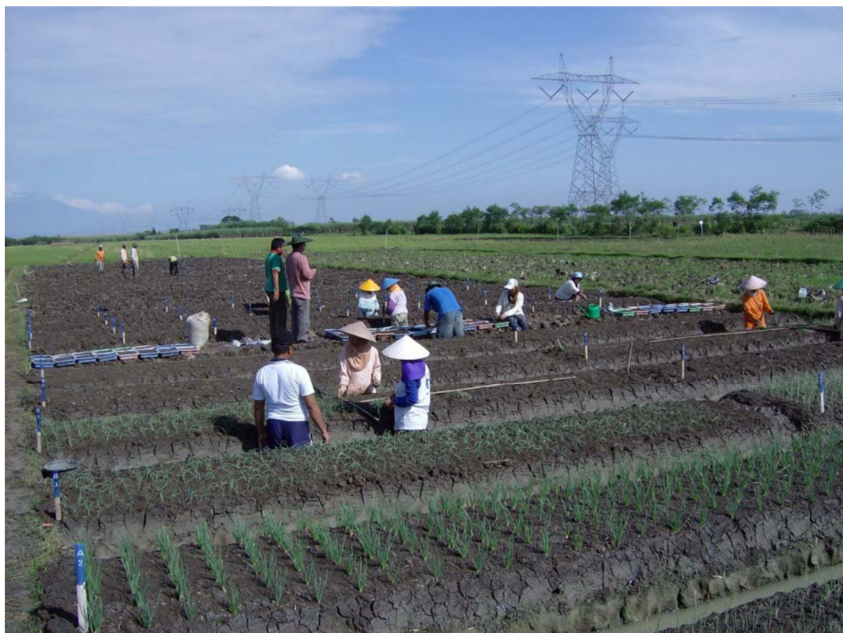
Picture 1. Overview of the activities in the field on 29 april 2009: transplanting of seedling in the early sowing experiment, sowing of the seed efficiency experiment and preparation of the beds for the fertilization experiment..