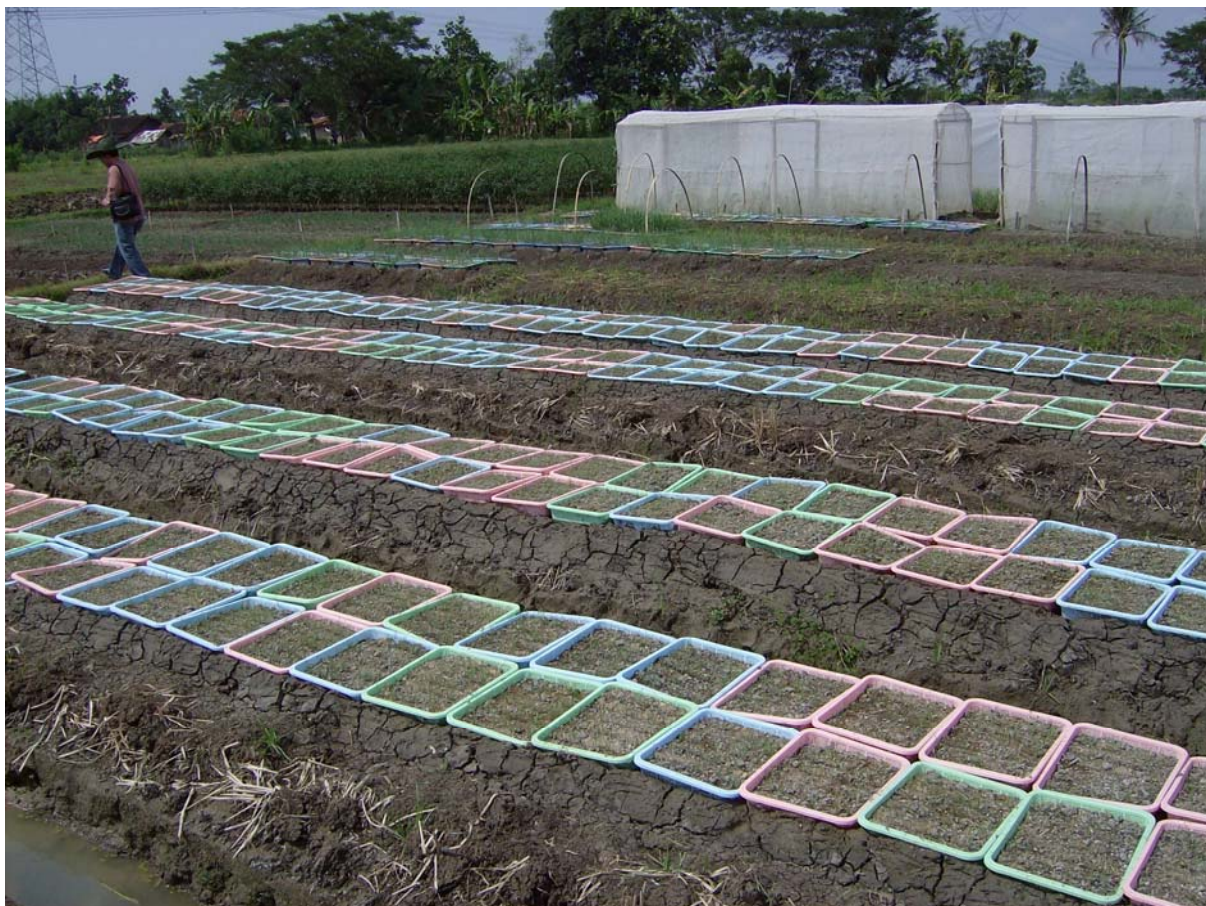
Picture 5. Nursery for the plant density experiment; sowing date 15 April.

Spraying against diseases and pests in the nursery was done intensively (Score and Amistar Top).