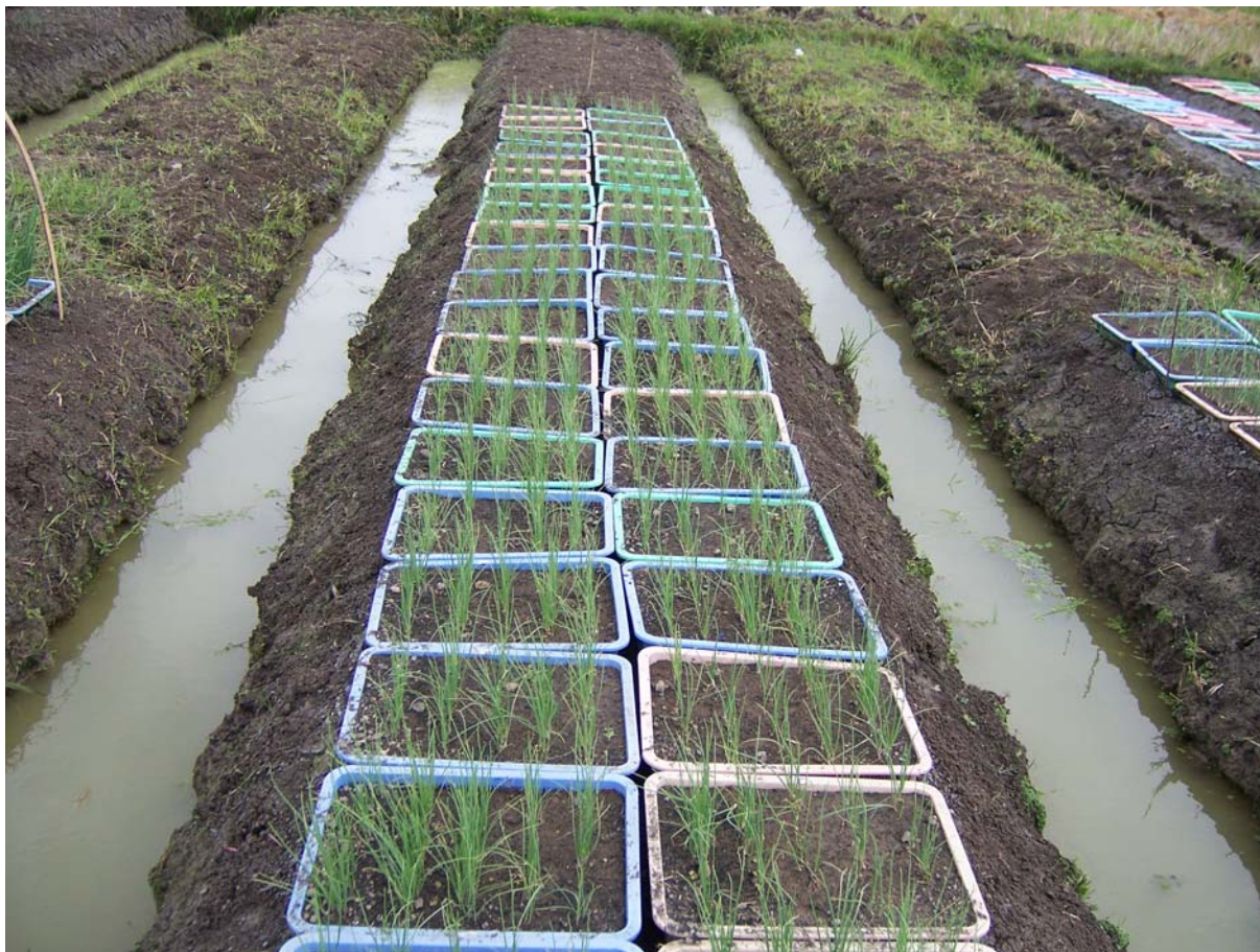
Picture 13. Nursery on trays.

after sowing was improving seed efficiency. This means that sufficient watering is also an important factor to improve seed efficiency.