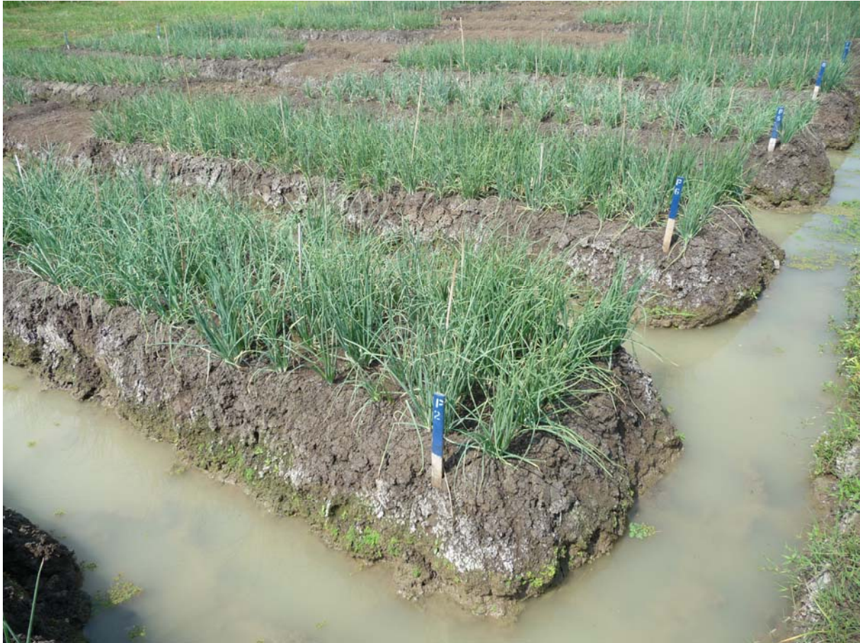
Picture 4. Experiment with planted seed bulbs of Tuktuk and the Hybrid in Brebes. Seed bulbs were harvested in the early sowing and transplanting experiment..