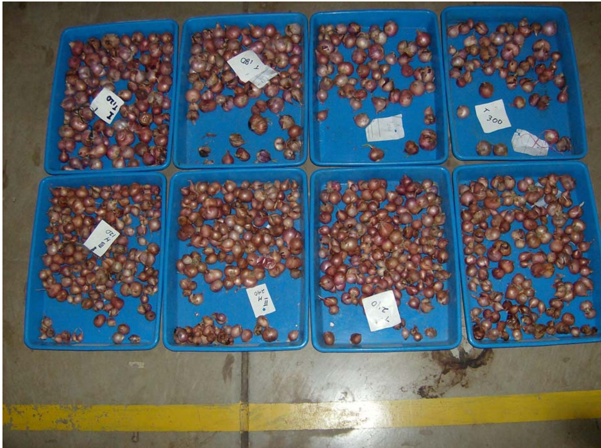
Picture 9. Healthy bulbs after three months of storage. Upper row of boxes: Tuktuk grown with 120, 180, 240 and 300 kg N/ha (from left to right). Under row of boxes: Hybrid grown with 120, 180, 240 and 300 kg N/ha (from left to right). At the start of the storage period each box had more or less the same number of healthy bulbs (within a variety).

the highest nitrogen level. In picture 9 this is illustrated: starting with the same number of bulbs after harvest it appears that Tuktuk grown at a higher nitrogen level has lost much more rotten bulbs after 3 months storage than the Hybrid.