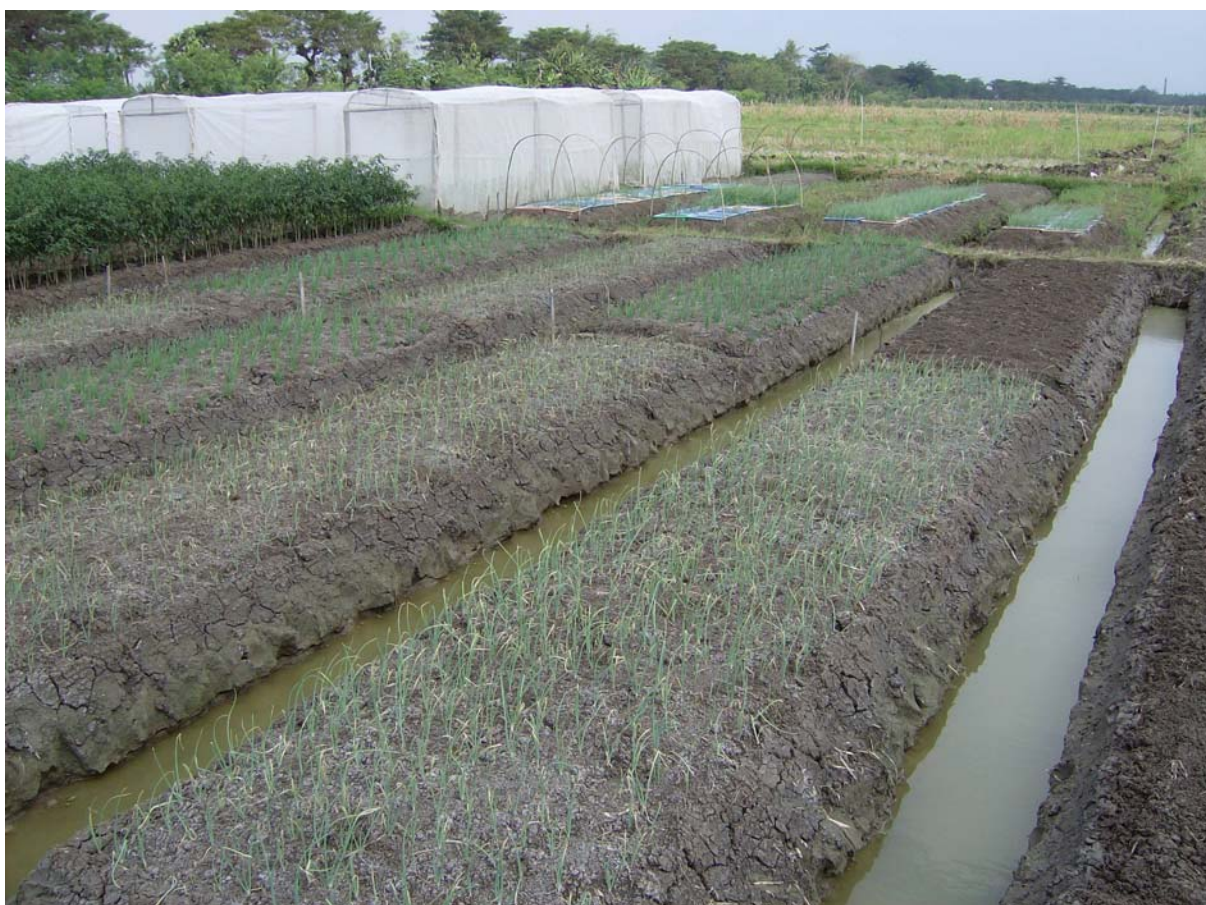
Picture 3. Early sowing and transplanting experiment: transplanted seedlings; transplanting date 15 April 2009.

The emergence of Tuktuk on beds was lower than on trays. The nursery sown with Tuktuk on 11 March was giving an emergence of 35% after 2 weeks and 21% after 4 weeks. The emergence sown with Tuktuk on 25 March was extremely low: 7% after 2 weeks and 1% after 4 weeks.