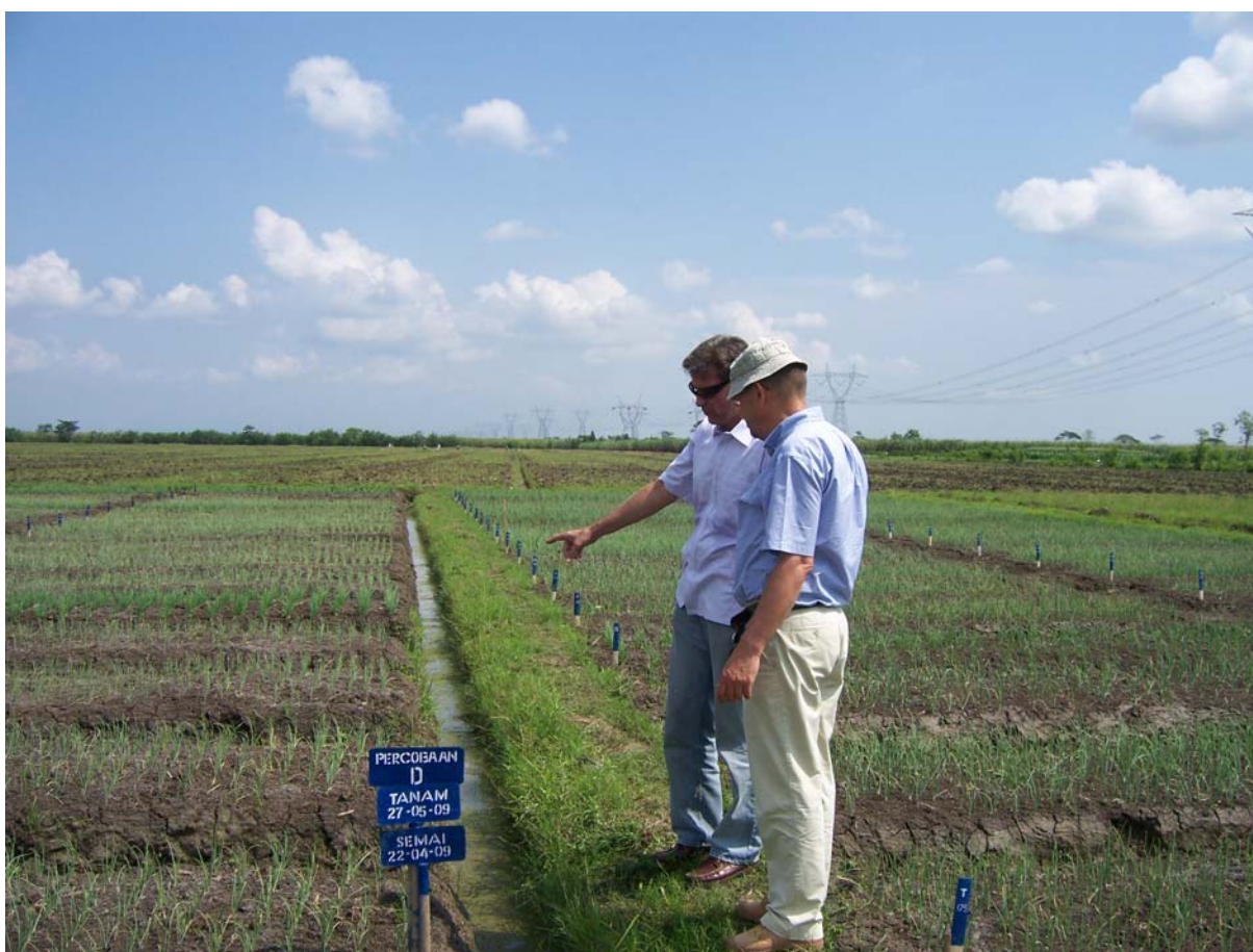
Picture 8. Nitrogen fertilization experiment in June, ca. 3 weeks after transplanting.

The harvest of Bima and Ilokos was done on 28 July and the harvest of Tuktuk and the Hybrid was done on 14 August. At the harvest the number of plants was counted on 10 representative rows of each plot. In the statistical analysis plant density was used as a covariable. This was done separately for Tuktuk and the Hybrid. This was done because of the different yield level of the varieties and because of the expectation that the varieties are different in reaction on plant density. For both varieties the effect of the covariable was significant (Fprob <0.001). In table 10 the mean yield is given based on the analysis with the covariable plant density.