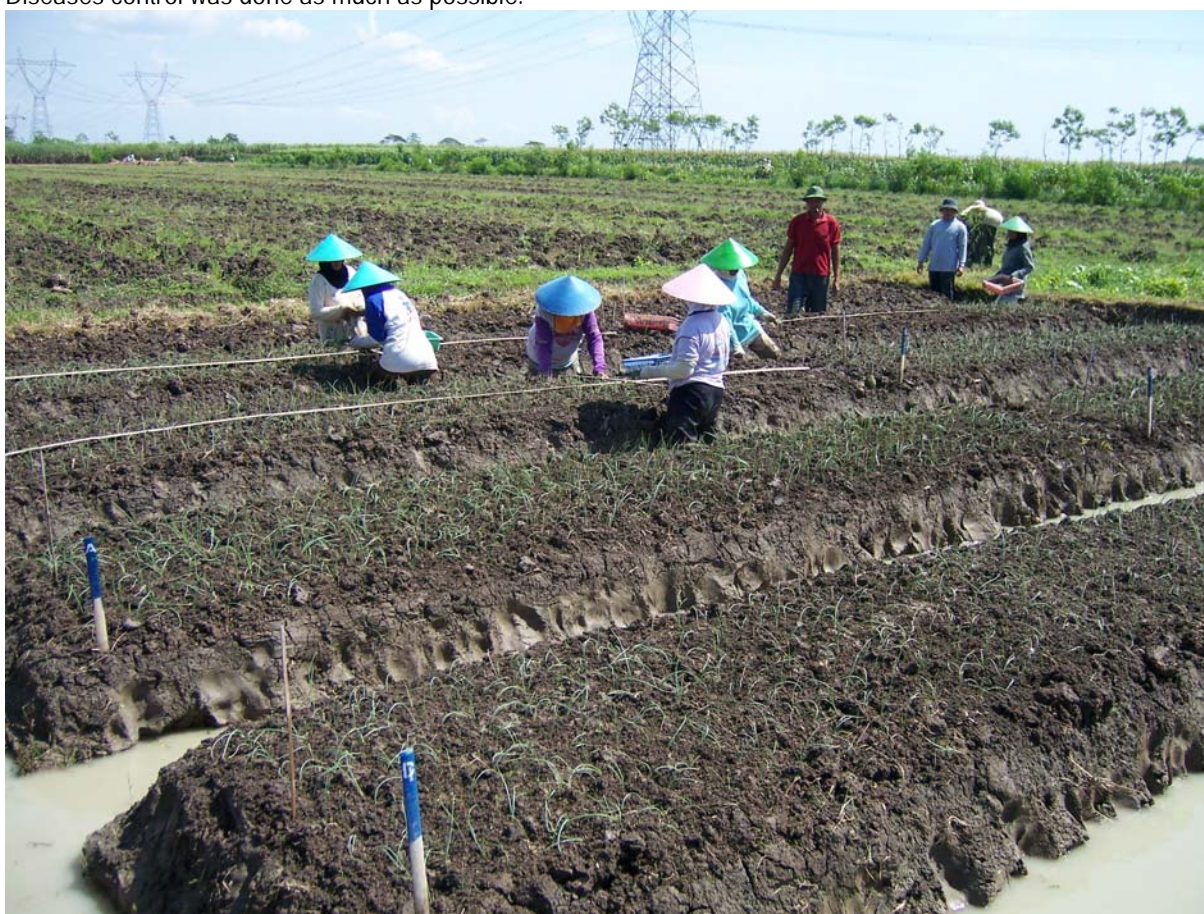
Picture 14. transplanting of the experiment "Age of seedlings and fertilization of nursery".

On 24 June the 5 and 6 weeks old seedlings were transplanted at 150 plants/m 2 . The fertilization was as follows: before transplanting 125 kg P 2 O 5 was given as SP36. Two weeks after transplanting 75 kg N/ha and 75 kg K/ha (KCl) was given. Half of the N was given as Urea and the other half as ZA. This was repeated two times: at four and at six weeks after transplanting. This means in total 225 kg N/ha, and 225 kg KCl. Diseases control was done as much as possible.