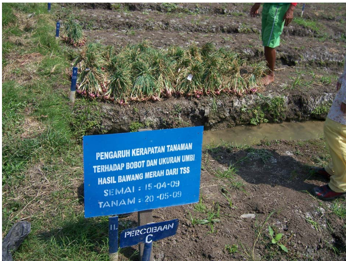
Picture 6. Harvest of the plant density experiment.