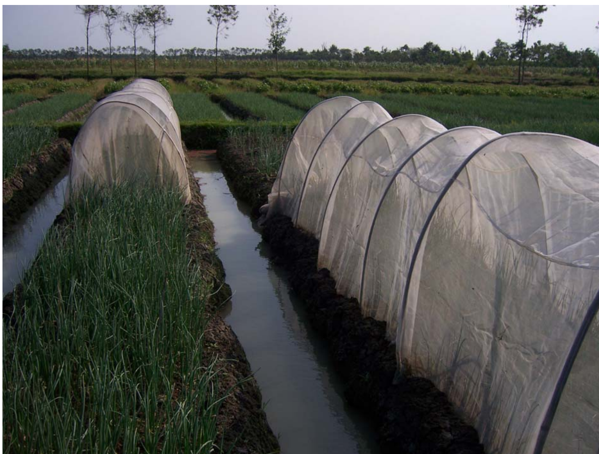
Picture 15. Experiment with TSS grown under insect nets.