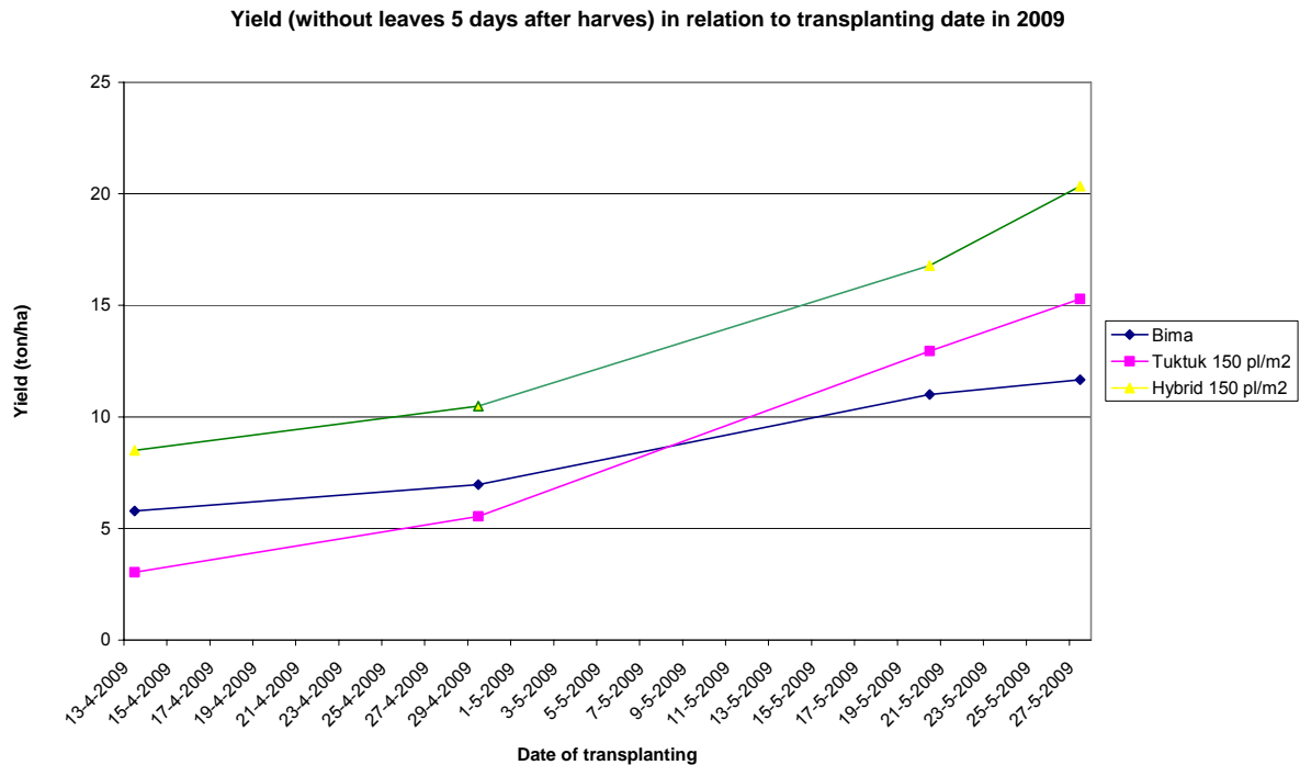
Figure 1. Yield (without leaves 5 days after harvest) in relation to date of transplanting in 2009.

Harvested bulbs were sent to EWSI for an experiment with planting seed bulbs of TSS. The main experience was that Tuktuk was losing very slowly dormancy. Another aspect was: the yield of the crop grown from seed bulbs of the hybrid was very heterogeneous. Before selling the product grading should be done. Data were not available completely at the moment of writing this report.