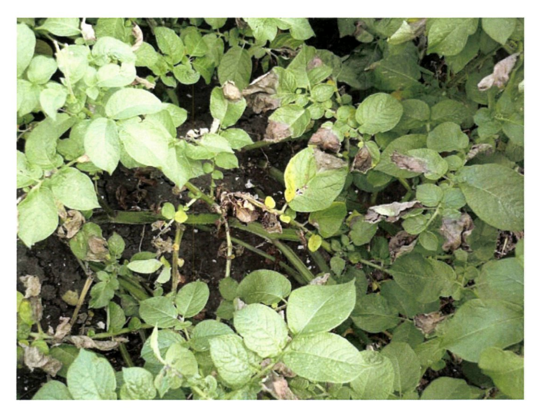
Figure 3: 3 August; infection of P. infestans in the experiment