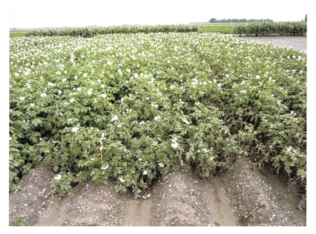
Figure 2: 17 July. On the right plot 1, K0; untreated; on the left plot 3, K1

Figure 1: One of the beams of the Sosef-trial-spraying machine (in another experiment). Every time the spraying machine goes to the experimental field 10 different products can be sprayed.