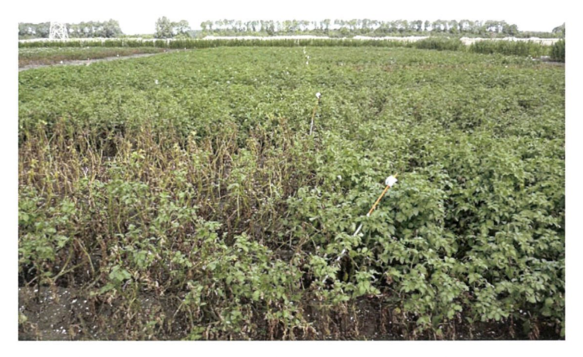
Figure 4: 3 August; overview experiment. In front left plot 1 and right plot 2.