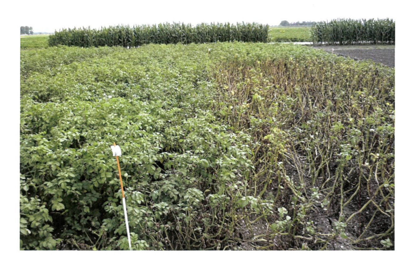
Figure 5: 3 August. On the right plot 1, K0; untreated; on the left plot 3, K1