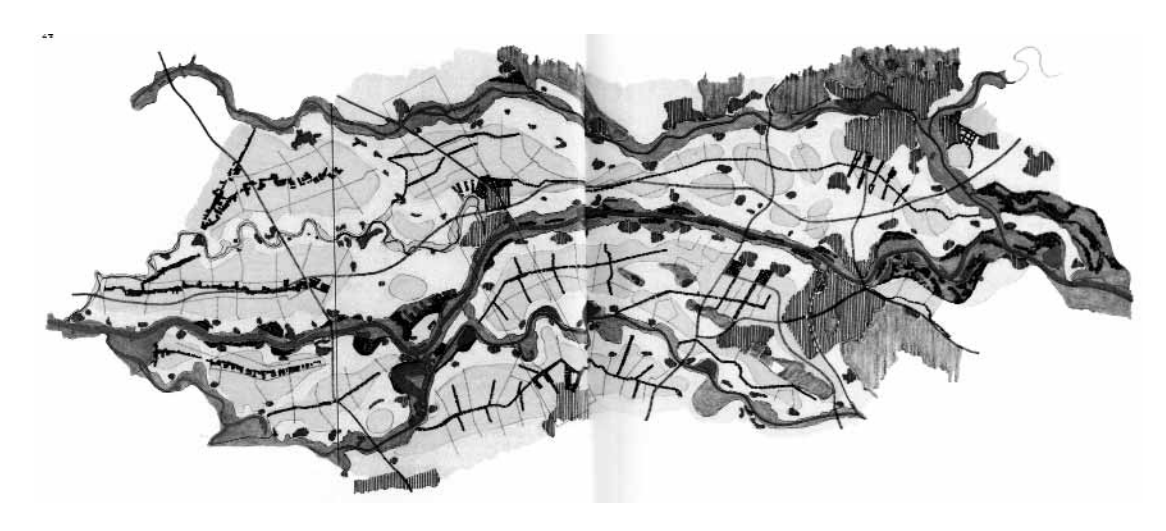
Figure 1 Schematic representation of the Rhine-Meuse Floodplain showing the contours of the casco-concept.

The authors of the Stork Plan had a different vision: in the long term the strategy of compromise would not be sustainable. Agriculture follows economic rules of expansion and continuous change; it is a 'high dynamic land use' and needs flexibility. In contrast, natural habitats, water management and historic landscapes require stability, they are (the result of) relatively 'low dynamic land uses'. The Stork strategy was to facilitate a 'two-speed landscape' in which robust, stable areas and dynamic areas could coexist and develop at their own speed. This was later called the 'casco principle'.