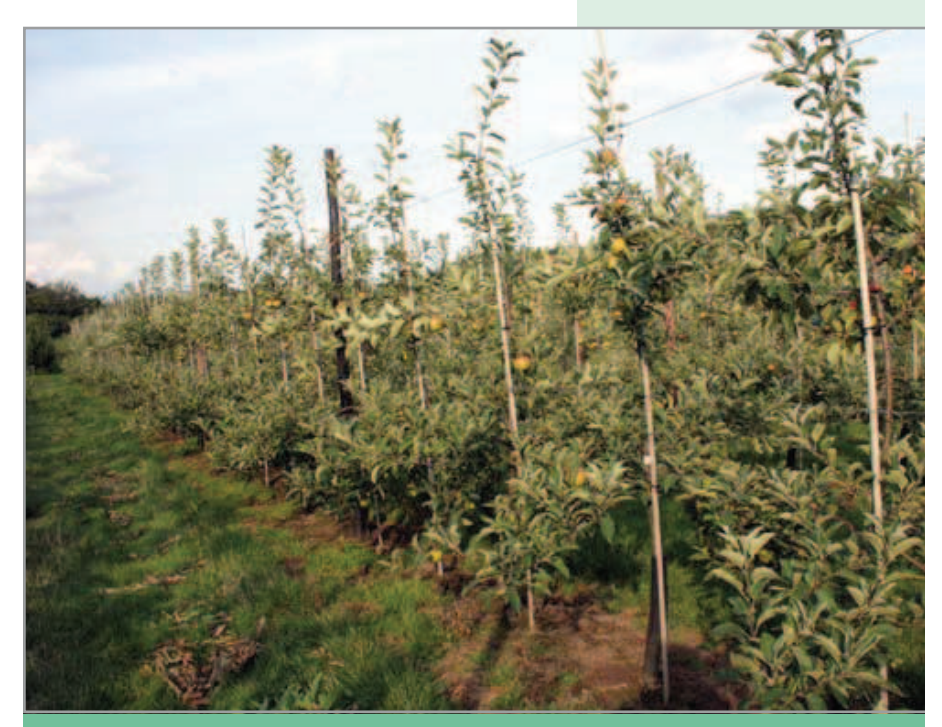
Sowing Tagetes considerably reduced the number of nematodes in the soil.

Soil samples showed that traditional chemical soil fumigation killed by far the most nematodes in the soil (see Figure 1). Sowing Tagetes also resulted in effective nematode control. This was also the case for the trial where first Tagetes was sown, then the plants were worked into the soil and then the soil was covered by plastic. The other treatments (black fallow, organic soil disinfection using Avena strigosa (Lopsided Oat or