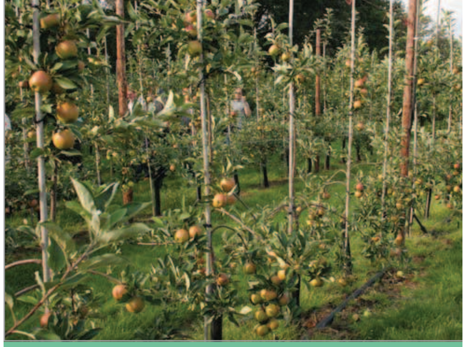
Trees growing too weakly in the untreated block (black fallow).

On the request of and financed by the Dutch ministry of Agriculture, Nature and Food Quality, the 'Praktijkonderzoek Plant & Omgeving' (PPO) research institute carried out research into