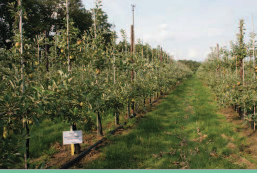
In this trial block, Tagetes was sown, the resulting plants were worked into the soil and then the soil was covered with plastic (organic soil disinfection).

Chemical soil fumigation clearly resulted in the best nematode control and the trees that grew most strongly (in the second leaf). Sowing Tagetes, whether or not worked into the soil that was then covered with plastic (organic disinfection), also resulted in trees that grew well, but somewhat less strongly than the trees in the chemically disinfected soil. The question is what is most desirable from the cultivation point of view. This will be shown in the coming years. Trees planted in a sandy soil that is infected by nematodes regularly continue to grow very weakly even after four or five years. A very good start (therefore with strong growth) can then be an advantage. However, if the nematode population remains small, somewhat weaker growth in the first and second leaf might be better. This is because it is known that when chemical soil fumigation is used, the nematode population can return to a high level once more after approximately two years. The expectation is that this will take about three to four years in a plot where Tagetes has been grown.