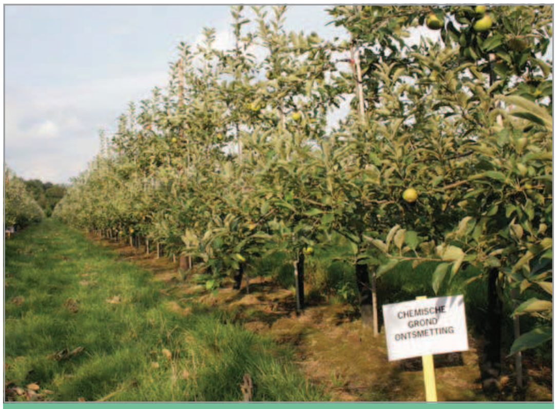
On the plots where chemical soil fumigation was used, the trees grew most vigorously.

because trees are planted in exactly the same place due to the presence of, for instance, the hail net construction, it is more often the case that trees grow poorly. There are various causes for soil exhaustion or Specific Apple Replant Disease (SARD) and the situation is not yet completely clear. What is certain is that there are multiple causes. In addition to nematodes (in particular Pratylenchus penetrans ), soil fungi and bacteria (such as Phytophthora, Pythium, Penicillium, Pseudomonas and actinomycetes) play a role in soil exhaustion. These saprophytic organisms can damage or inhibit the growth of the young plant roots.