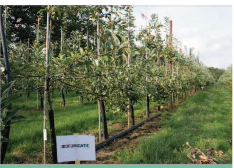
Biofumigation using Sarepta mustard promoted instead of reduced the number of nematodes.