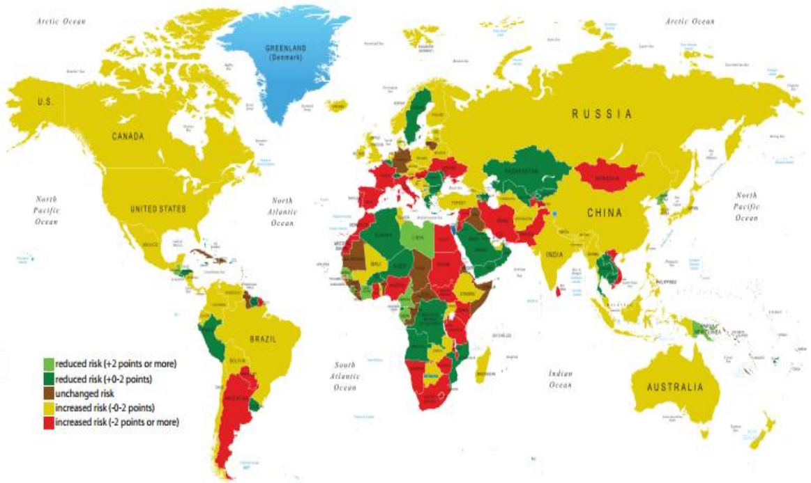
Euromoney Country Risk Survey Results, June 2012