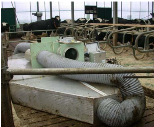
Figure 1. Open flux chamber.

Two of the emission reduction systems, identified as A and B, were concrete floors and one was an emission reduction systems covering the slurry in the pits, identified as C. Reduction principle of both A and B is based on a fast removal of urine and a separate removal of the feces by scrapers. Floor A is a complete solid floor closing the pits, floor B has slots between solid floor element to drain urine and feces to the pits. Both floors have a pattern of grooves to prevent cow slip incidence. The experiments were conducted at three different practical dairy farms in the Netherlands, one for each systems. Emission of all reduction systems was related to emission of a references floor. In all cases a concrete slatted floor with slurry pits was used as a reference.