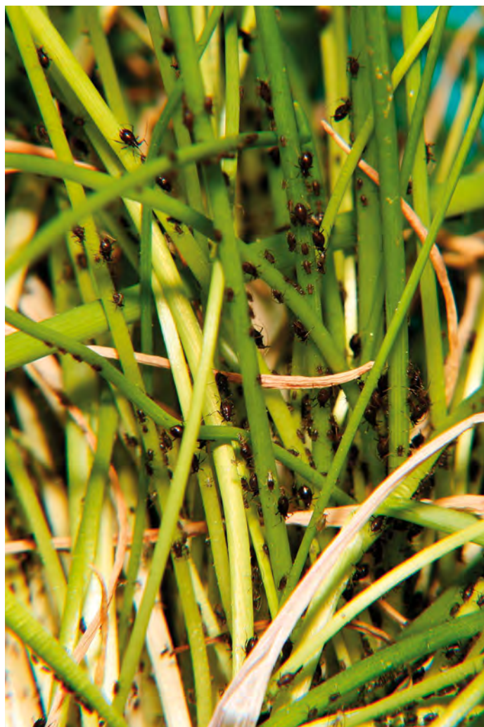
2. Colonization of Allium schoenoprasum by Neotoxoptera formosana . 2. Kolonisatie van Neotoxoptera formosana op bieslook.