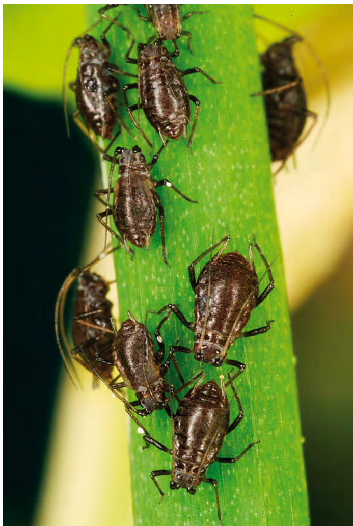
1. Neotoxoptera formosana on Allium schoenoprasum . 1. Neotoxoptera formosana op bieslook.