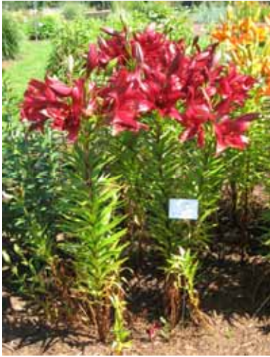
Red Alert Cornell Year 3