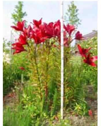
Red Alert Holland Year 3