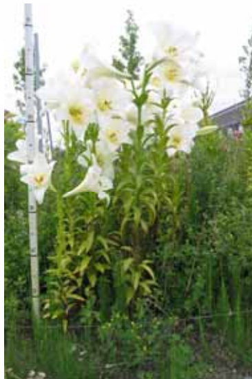
White Heaven Holland Year 3

The site will continue to be updated as we move forward. Send any questions or comments to me at wbm8@cornell.edu