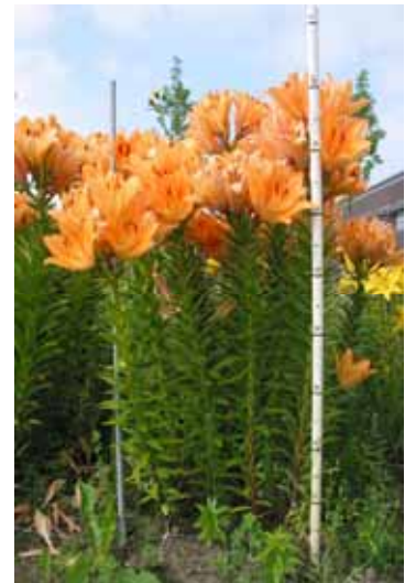
Royal Trinity Holland Year 3