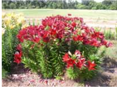
Red Alert LSU Year 3