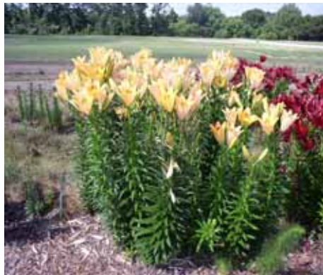
Royal Trinity LSU Year 3