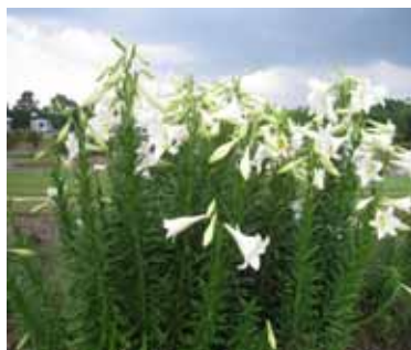
White Heaven LSU Year 3