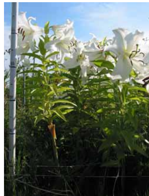
Casa Blanca Holland Year 3