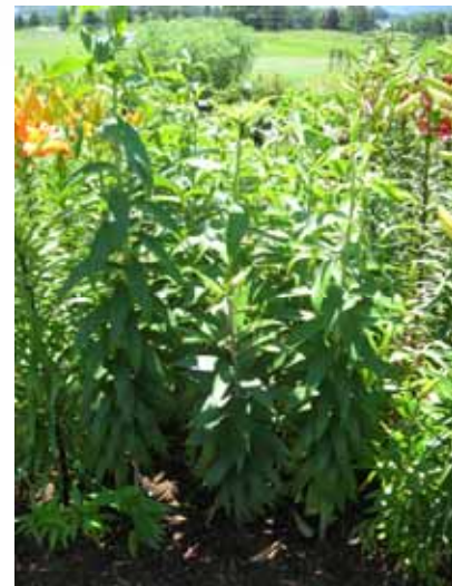
Casa Blanca Cornell Year 3