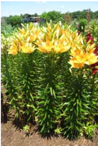
Royal Trinity Cornell Year 3