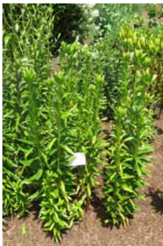
White Heaven Cornell Year 3

NOTE: there is no picture for LSU as all plants were dead.