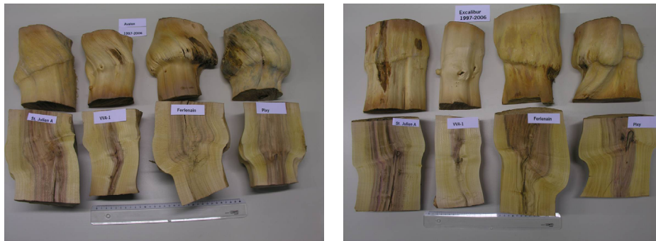
Fig. 2. Graft unions of 'Avalon' (left) and 'Excalibur' (right) on St. Julien A, Krymsk ® 1 (VVA-1), Ferlenain, Pixy (from left to right) at the end of the 10 th leaf.