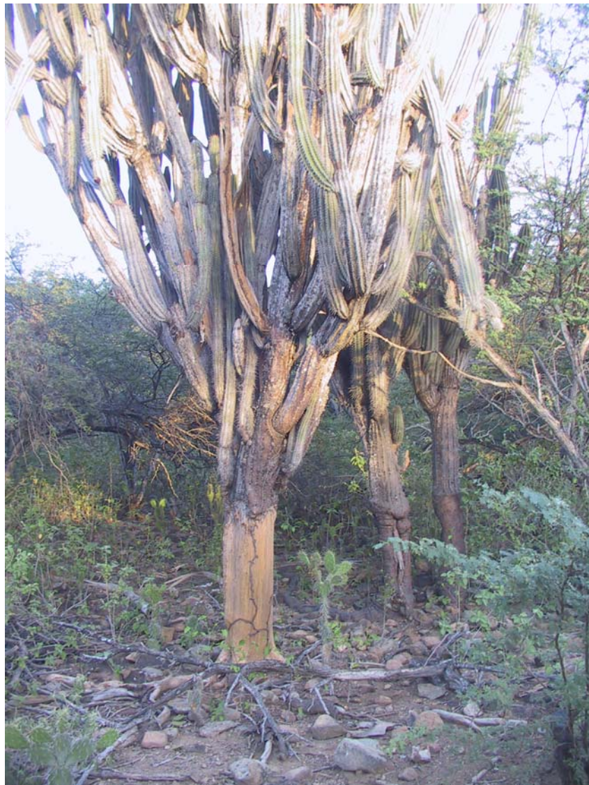
Figure 1. Goats and donkeys inside the Washington Slagbaai National Park are decimating the population of adult candelabra cacti by gnawing off the bark of these important trees. The trees form a key food source for other animals such as birds and bats.

The best prospects for addressing the overgrazing issue in the Caribbean Netherlands are inside the Washington Slagbaai Park in the section of Slagbaai, which is privately owned and where the park management has full authority to deal with the problem. Preparations have been made for eradication by separating Slagbaai from the Washington section with a perimeter fence to prevent goat movement, and experienced volunteers to guide this effort have been identified. A recent review by Staatsbosbeheer stresses the urgent need to address this issue for the park (Blok 2010).