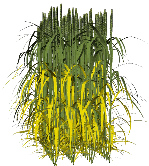
Figure 1. Simulated stand consisting of 4 rows of 15 wheat plants each, created using the FSPM methodology. Reprinted from Evers et al. (2011) with permission from Elsevier.

In combination with dedicated experiments, this modelling tool can be used to analyse the response of plants to (imminent) competition, simulate the competitive advantage of shade avoidance for plants of different architecture, and predict plant form in various light environments. To assess the effect of plant population density through R:FR signalling on tillering (branching) in spring wheat ( Triticum aestivum L.), an FSPM study was conducted (Figure 1). A simple descriptive relationship was used to link R:FR as perceived by the plant to extension growth of tiller buds and probability of a bud to form a tiller. A further study included a complete sub-model of branching regulation, aiming at simulating branching as an emergent property in Arabidopsis thaliana under the influence of R:FR. These and other studies show that FSPM is a promising tool to simulate aspects of plant development, such as branching, under the influence of environmental factors. In close combination with dedicated experiments, FSPM can shape our ideas of the mechanisms controlling plant development, can integrate existing knowledge on plant development, and can predict plant development in untested conditions.