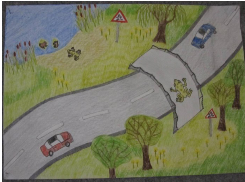
Fig. 2. Runner up of the "On Dangerous Roads" Competition organized by Varangy Akciócsoport Egyesület for the 2010 Infra-Eco Network of Europe Conference showing an overpass used by wildlife. An ongoing project in the Netherlands is studying the effectiveness of an overpass for amphibians, in combination with fences along the road. This overpass is equipped with a cascading series of small ponds fed with water pumped into the highest pond in the center of the overpass.

suitable habitat for small mammals. Only 2 of 13 species of small mammals were never captured near roads, and the remaining 11 species' numbers were either similar or more abundant near the road than further away.