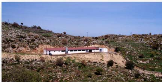
Sheep farm in the Greek mountains

Under extensive production, sheep of the local 'Sfakia' breed are kept outdoors for most of the year feeding on available indigenous vegetation. Grazing is continuous mostly on marginal common lands and areas grazed by individual flocks are not clearly defined. Small fields are sown with oats or barley for sheep grazing, and in some cases, vetch is sown for grazing in olive groves. Supplementary concentrates are provided from the beginning of autumn to the end of winter (September to February). Between November and January a small quantity of purchased lucerne hay is also offered to the animals.