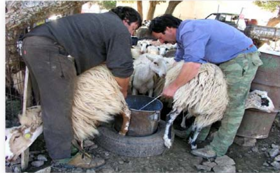
Hand milking on an extensive sheep farm

Natural mating takes place in May-June, therefore lambing occurs around October-November. Lambs are raised on their mothers until weaning at the end of December. At 60- 80 days after lambing lambs are slaughtered at live weights of 13–16 kg and the milking of the ewes begins. Initially ewes are mostly hand-milked twice daily (morning-evening) from weaning and this is reduced to once a day (morning) by mid June until the end of the milking period in late July.