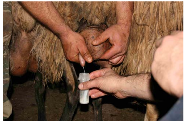
Taking milk samples for fatty acid