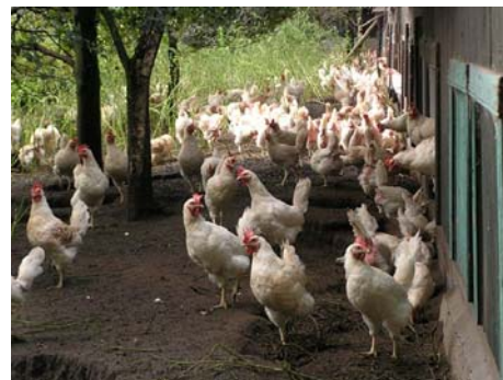
Feathering of hens is scored on 50 animals/flock during the farm visits