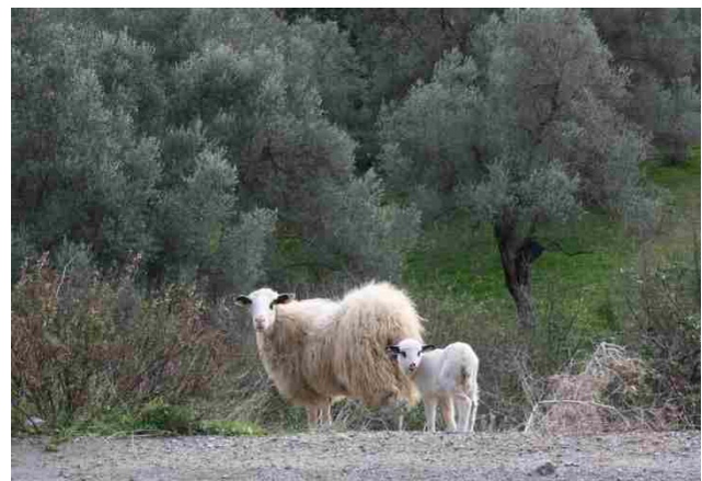
On the island of Crete, Greece, farmed sheep belong to the local breed Sfakia.

Mediterranean sheep and goat production has historical and cultural links with long history in Greece and has survived because it is contribution to national identity as a traditional activity.