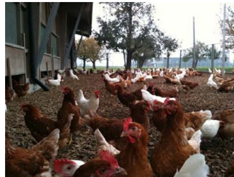
Mixed flocks of white and brown genotypes are typical for Swiss organic farms

The farm visits will be carried out during 2011. In 2011 further workshops will be arranged depending on the topics the farmers indicate as necessary and/or interesting.