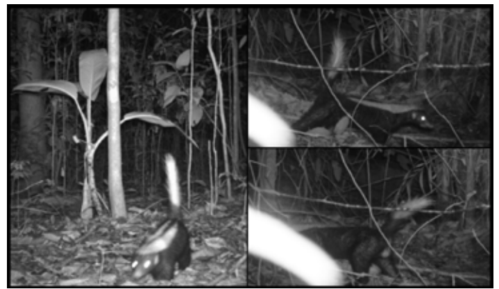
Fig. 2. A male Striped Hog-nosed Skunk Conepatus semistriatus captured by two different camera-traps in the Peña Blanca peninsula of the Barro Colorado Nature Monument, central Panama, March 2010.

The historically known distribution of C. semistriatus in Panama is based on museum records, all of which originate from localities close to the border with Costa Rica. More recently, Araúz (2005) reported personal observations of the species in the provinces of Veraguas, Coclé and Colón, some